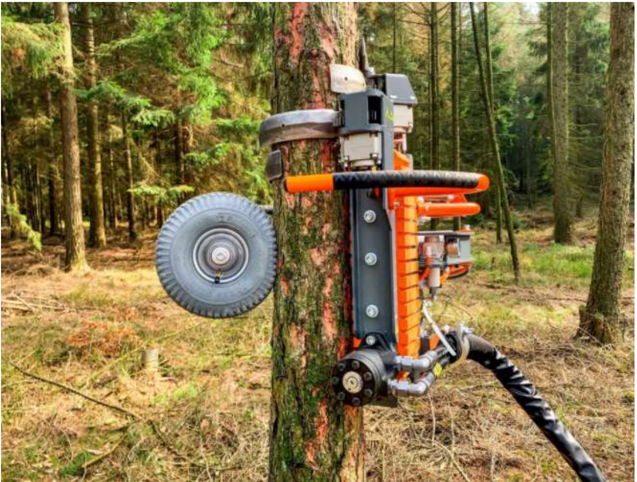
Figure 18 Advaligno Patas Cutting Head