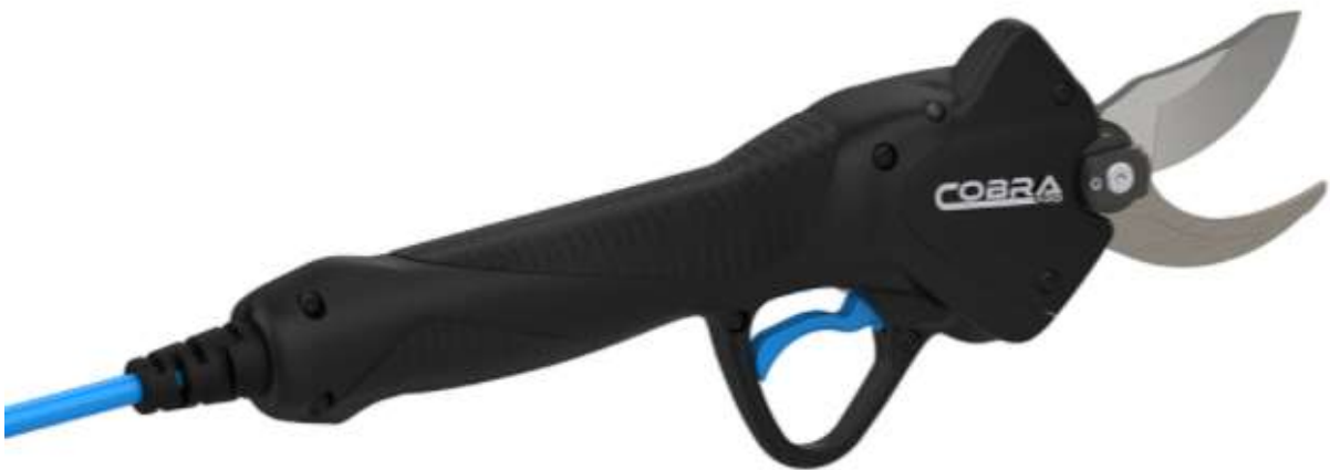
Figure 15 Campagnola Cobra