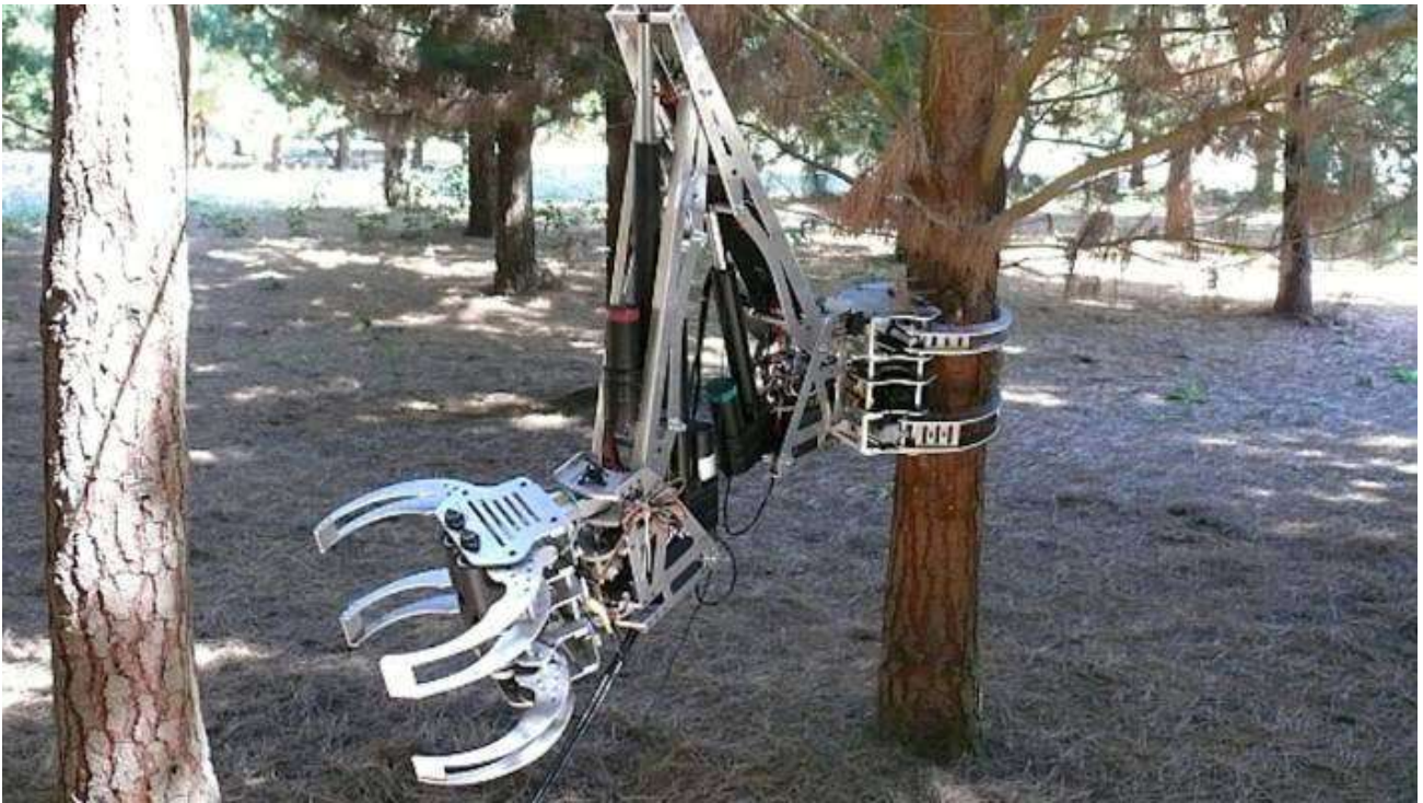
Figure 20 Scion Tree to Tree Robot

In NZ, our own tree to tree robot was developed by the FGR Harvesting theme. This could be adapted to not only thin trees but also prune.