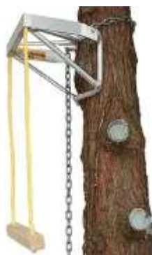
Figure 4 Step