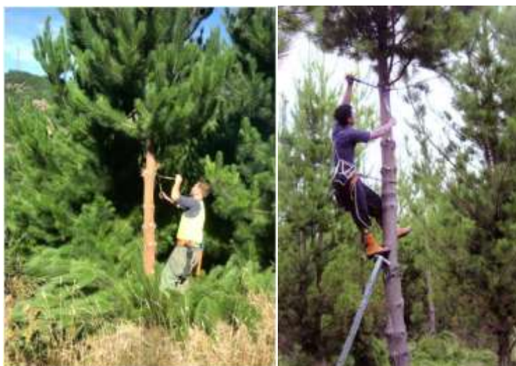
Figure 1 Pruning from the ground and ladder

This has continued to be a very manual process apart from the use of smaller chainsaws. These have improved productivity but also introduced health and safety risks such as cuts and hearing damage. Some forest owners moved away from chainsaw pruning due to tree damage, where additional cuts and nicks were appearing on the bark. This is caused by the fast-moving saw chain. With ongoing issues with labour supply some forest owner/managers are now finding it difficult to get their targeted pruning areas completed.