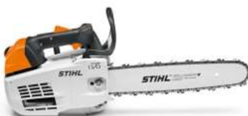
Figure 6 Stihl 021 Top handled pruning chainsaw

The second method of pruning in New Zealand is still manual but uses a motorised device. This is a top handled chainsaw