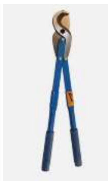
Figure 2 Loppers

The manual tools currently being used in New Zealand consist of a mix of hand tools and different height ladders depending on the pruned lift