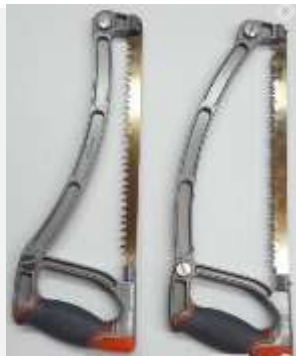
Figure 3 Jacksaw