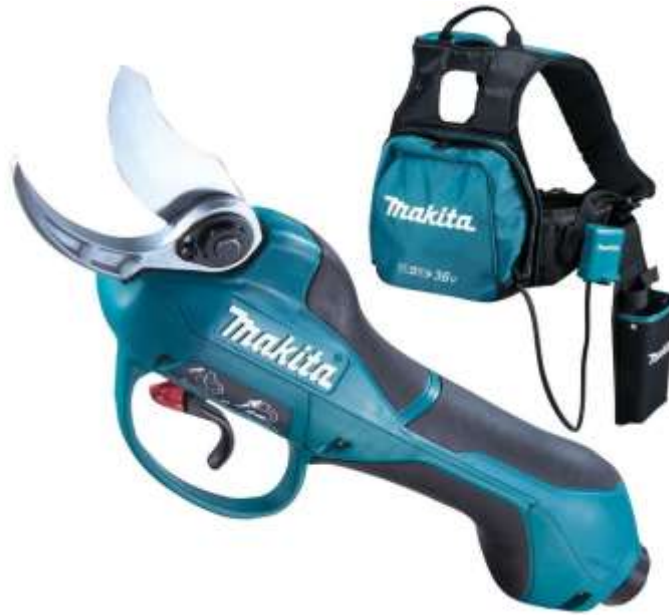
Figure 12 Makita DUP362