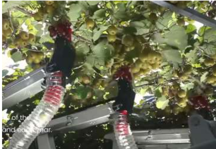
Figure 21 Robotics Plus Kiwifruit picker

Figure 14 is a robotic kiwifruit picker which has 4 arms and an array of cameras are at the heart of the machine, which uses a series of learning algorithms to map the canopy above in three dimensions. (RoboticsPlus, 2022)