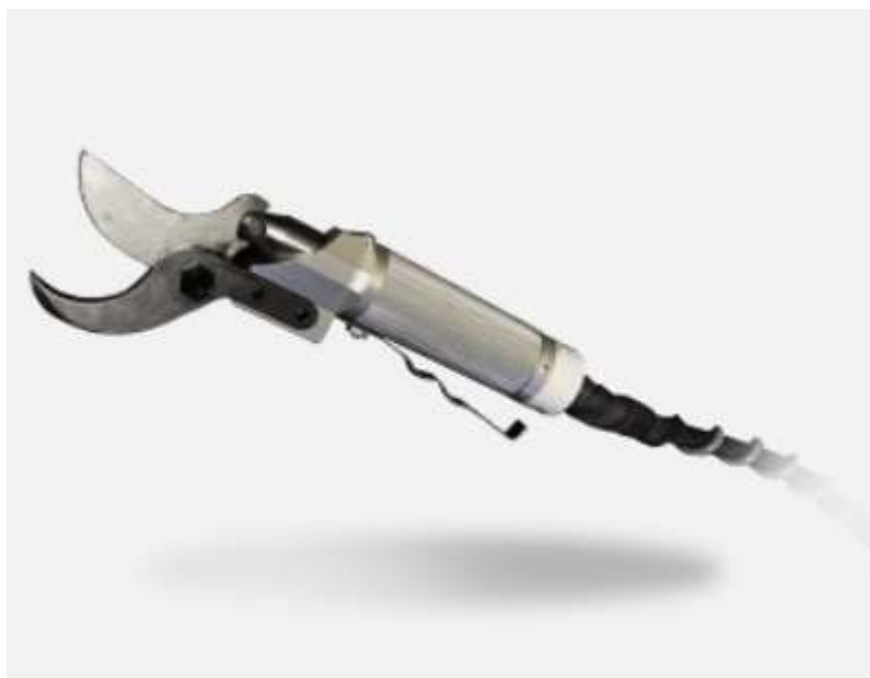
Figure 11 50mm opening

There are a number of manual and now battery pole saw options available, none of which are currently used in the New Zealand forest industry. Small amount used in Farm Forestry operations Nelson (Rod, 2022)