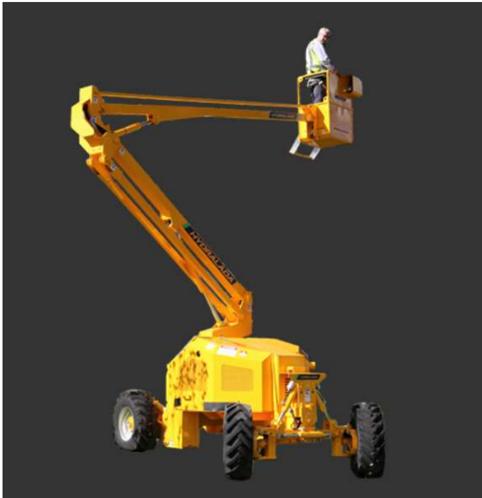
Figure 10 Hydralada PH12 Slew Boom

Attachments for this equipment include a pole or pistol grip saw and pole secateurs