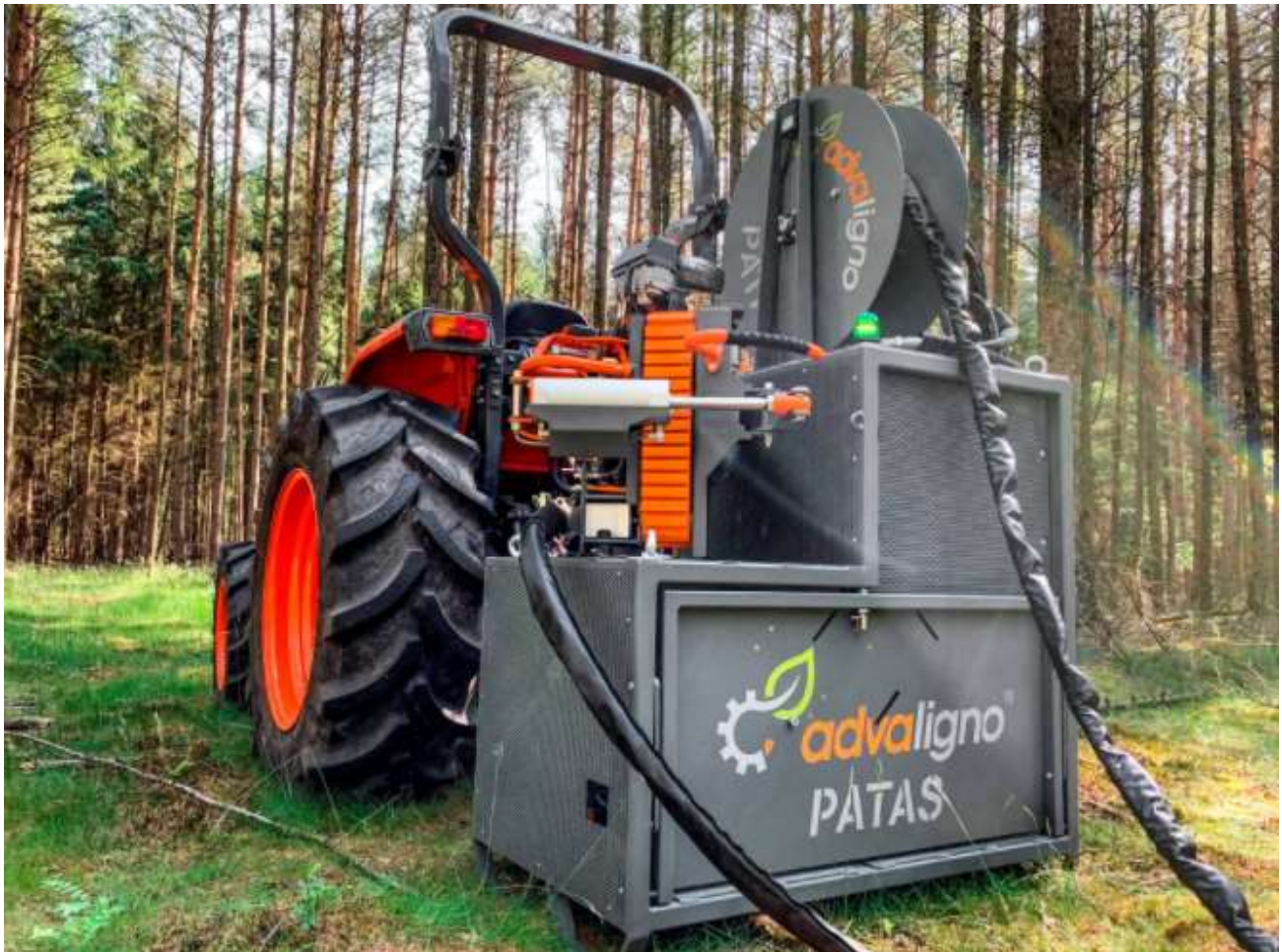
Figure 19 Advaligno Patas Drive Unit

The Advaligno PATAS was developed by the Jordan family company in Germany. It is named after the fastest climbing monkey. The system consists of two modules: a drive unit for connecting to a small tractor (min 40hp), and a cutting unit, which then works on the tree. When working, the required speed is achieved through a hydraulically driven rubber umbilical cord. This ensures minimal bark pressure and maximum grip. The blade on the cutting head separates all branches from the tree cleanly. Possible output 30 to 50 trees per hour. Simple operations could be performed within a range of 12 to 15 meters. Cutting head part alone is 50 kg. (Advaligno, 2019)