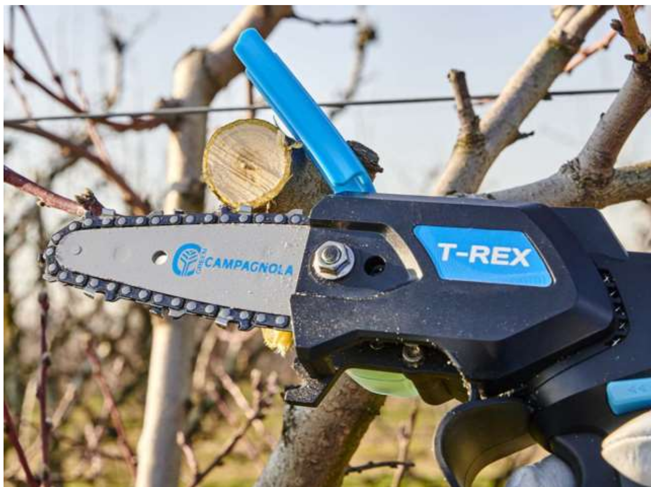
Figure 16 Campagnola T Rex