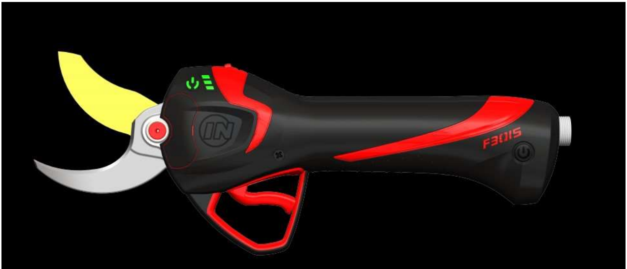
Figure 14 Infaco Electrocoupe F3015