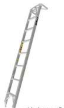
Figure 5 Ladder 4.0m

The second method of pruning in New Zealand is still manual but uses a motorised device. This is a top handled chainsaw