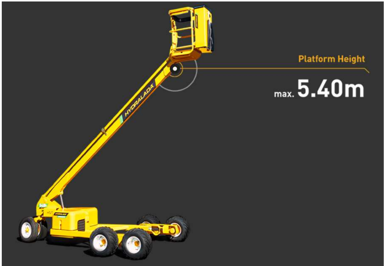
Figure 9 Hydralada 540H MAXI

In New Zealand we have the Hydralada options which are generally used in the horticulture industry