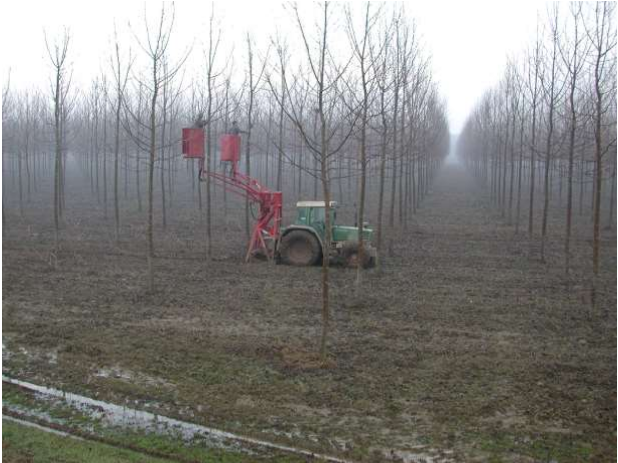
Figure 7 Poplar pruning in Europe (Spinelli, 2022)

In Europe on the flat country where they call it tree farming not forestry they are using a twin lift attachment run behind a tractor; The tractor movements are made by the tree pruners. The pruners used are a pneumatic secateur. This is not something that would suit most of New Zealand's plantation forestry conditions but may suit the flatter conditions of the central North Island.