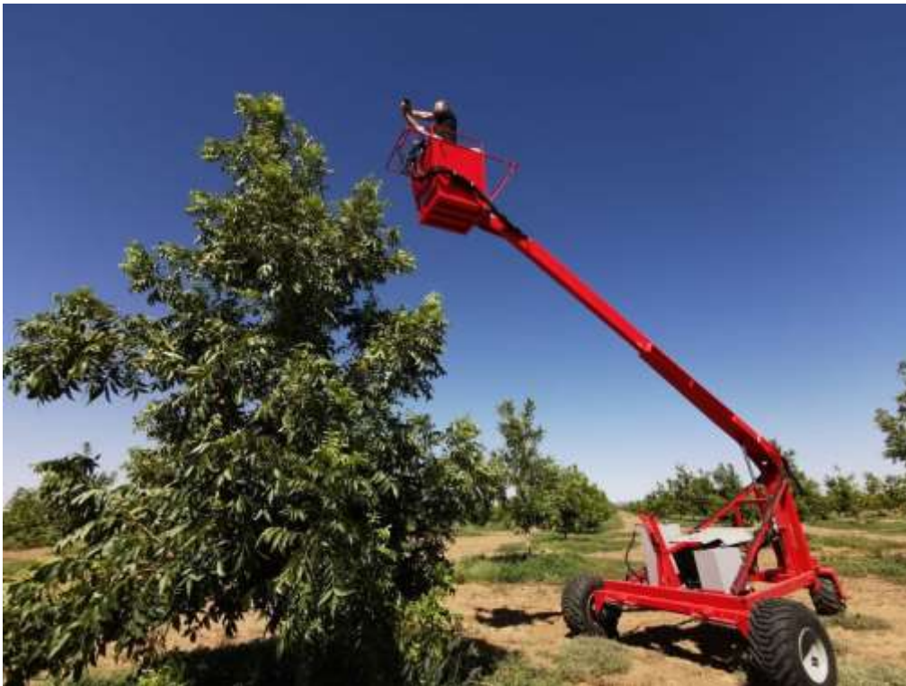
Figure 8 Red Ant Pruning Tower

Similar machines from South Africa are the Red Ant Pruning Tower