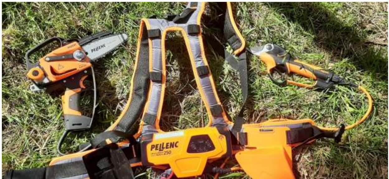
Figure 13 Pellenc Prunion 250 and Selion M12