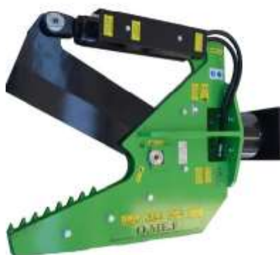
Figure 17 OMEF CS 100 Tree pruner

The OMEF CS 100 tree pruner is an excavator attachment that will fit a 1.5t machine and will cut branches from 100 – 250 mm dependant on the attachment size, this is Italian made. This would be slow in its current form and have trouble cutting the branch flush with the branch collar. ($7,000 from Forest Quip NZ) (Gill, 2022)