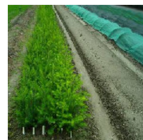
Cuttings growing on for planting