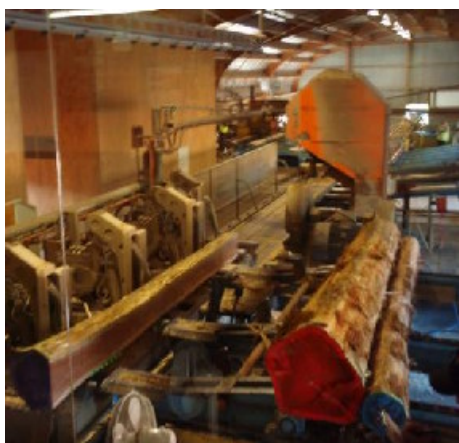
Milling Mangatu redwood logs

Paul went on to report progress on two redwood trials where silviculture is almost complete. His perceptive observations deserve a mention: he noted that follow-up treatments may be required with redwoods because, unlike nearly all other conifers, they mostly do not die if thinned – they coppice. Spring pruning generates a flush in epicormic growth (depending greatly on which clones are used) but if the epicormics are pruned sufficiently early, the pruning stubs may actually be extruded – as in some eucalypts. From these trials, it should be possible to retrospectively calculate the time for all knots to occlude.