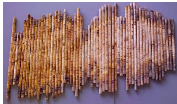
Using cores for durability studies

The 20-year old trees provided data on the extent of heartwood formation. Distinct latewood bands could be seen (unlike with pure cypresses), which simplified ageing the samples. Clones differed markedly in colour and smoothness. Leighton Green was the most vigorous clone while Green Spire had the most heartwood. The physical properties of each clone could be examined using Silviscan data yielding such things as density, Microfibril Angle and therefore stiffness.