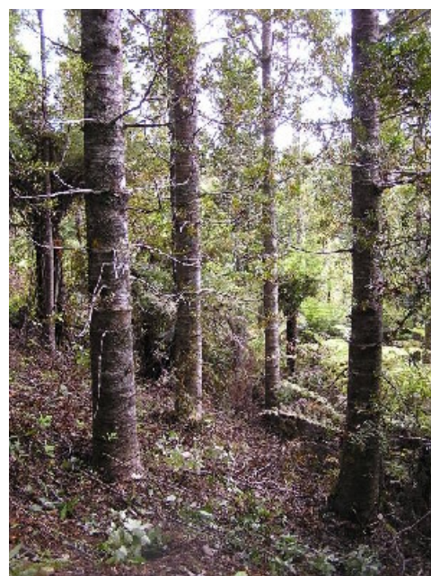
Planted kauri stand