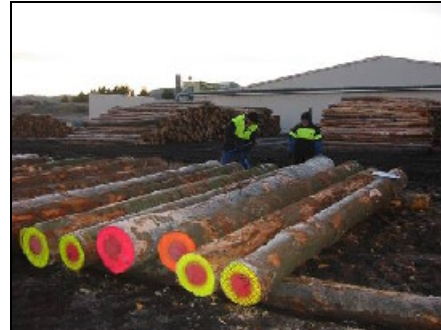
Douglas-fir sawlogs and sawn timber from MoE study