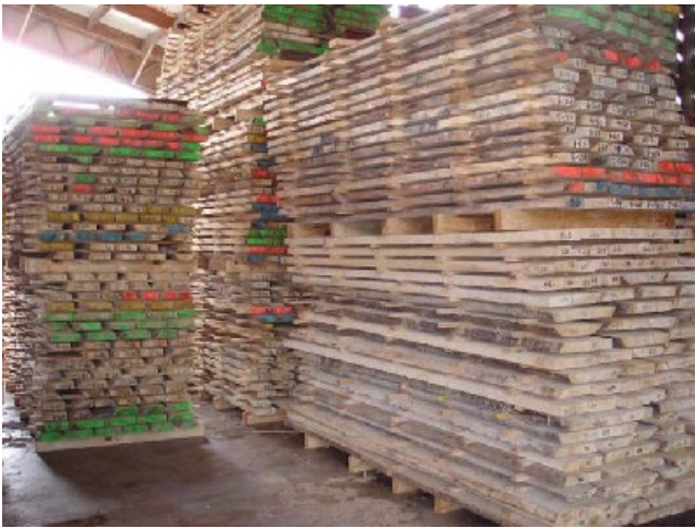
Drying the sawing study timber

Trevor Jones described a sawing study of 25-year old fastigata , globoidea , muelleriana and pilularis . The reasons for the study were the same as for redwood (described earlier), but in addition the outturn of these four species could be contrasted. Comparisons were made of DBH, wood density, stiffness, volume, heartwood, end splitting, flitch movement, total board recovery, shrinkage after drying, crook and bow, and surface hardness. It is hard to draw many robust conclusions based on this one study, but suffice to say that all four have the potential to produce high-quality timber on a 25-year rotation, and that the main constraints are the presence of growth stress and also knots in unpruned stands.