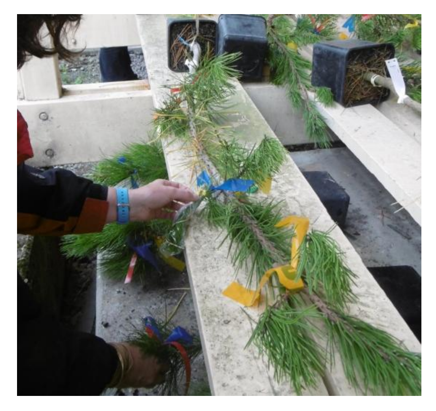
Figure 1. In planta inoculation.

On 9 April 2015 the plants were inoculated with zoospore suspensions. Within two hours of inoculum being produced, 30 ml of inoculum for the four different zoospore concentrations or pond water were attached to branches in plastic bags (Figure 1). Each tree was inoculated with all four treatments and a control. The only exceptions to this were one ramet for clone B that was not inoculated with the 20 zoospores per ml concentration, and another clone B ramet that was not inoculated with the 200 zoospores per ml concentration; in both cases this was due to a lack of available branches on the plants for inoculation. The needles were left in the inoculum for 20 hours outside. The following day, the plastic bags were removed and the plants were left outside for a further 11 days to allow lesion development.