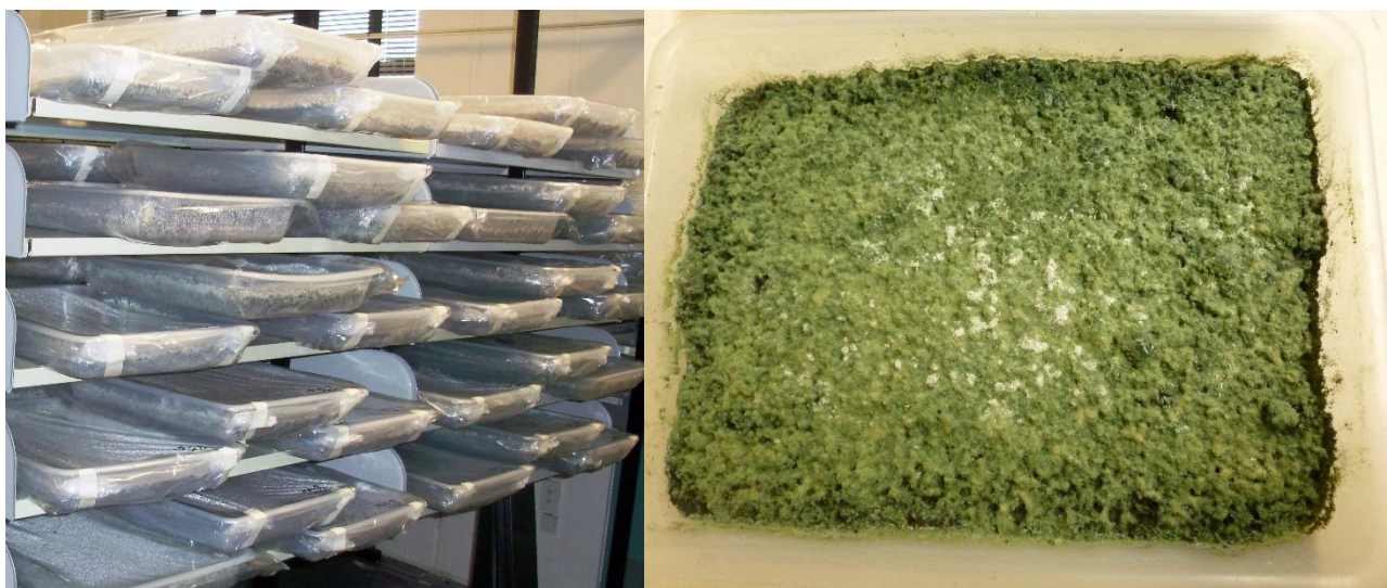
Figure 1. Trichoderma production using peat/wheatbran substrate in 5 litre trays.

Equal volumes of peat, wheatbran and water were mixed thoroughly. For each tray, 1.5 litre (~700g) of substrate was dispensed into small autoclave bags which were in enclosed larger bags and autoclaved at 121°C for one hour. Substrate was stored at 4°C after autoclaving. For inoculation, Trichoderma isolates were streaked onto plates of MYE agar (malt extract 1.0%, yeast extract 0.1%, agar 2%) and incubated for 1-2 weeks at room temperature. Spore suspensions for inoculating substrate were prepared by pouring ½ strength potato dextrose broth (PDB, Difco) onto sporulating colonies on MYE agar plates and harvesting conidia by scraping with a glass spreader. Each bag of substrate was inoculated with 50 ml of spore suspension and mixed thoroughly by kneading to ensure the spore suspension was evenly distributed through the medium. Each inoculated bag of substrate was transferred aseptically into sterile 5 litre polypropylene trays and spread to form an even layer approximately 2 cm deep. Trays were covered in large plastic bags with the ends folded closed and sealed with tape. Trays were incubated at 23°C under ambient light conditions until prolific sporulation was observed (e.g. 10-21 days).