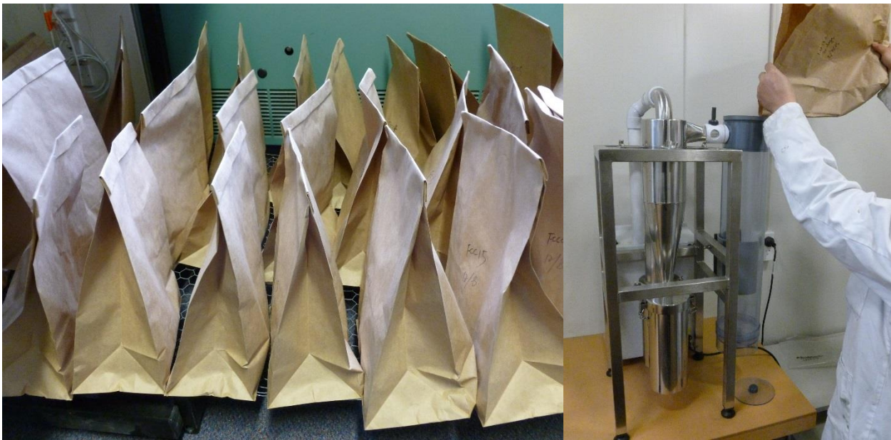
Figure 4. Drying bags of Trichoderma inoculum (left), Mycoharvester spore extractor (right).

After drying, conidia were extracted using a MycoHarvester (v5, VBS Agriculture Limited) according to the manufacturers instructions (Fig. 4). To determine the concentration of spores in the final product, 10 mg of spore material was suspended in 10 ml of 0.01% Tween 80 and numbers of conidia/g determined from haemocytometer counts.