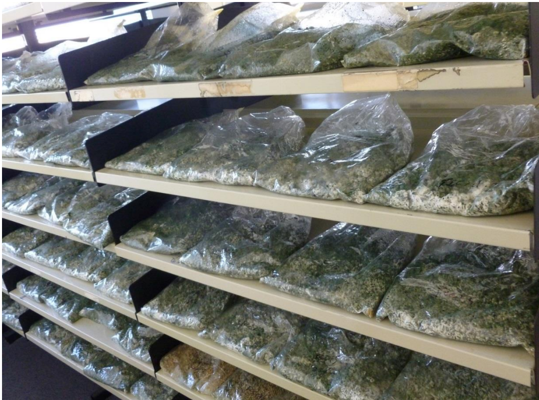
Figure 3. Sporulating cultures of Trichoderma grown on a brown rice substrate.