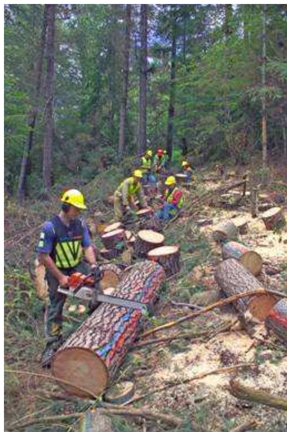
Preparing the discs and collecting data at NN530/2

Wood samples have been analysed with SilviScan to give quantitative wood properties and the resulting data will be linked back to the disc images.