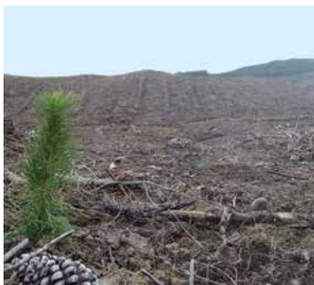
Recently planted seedlings at the Ngaumu Forest site, Wairarapa.

The new trial involves the use of Pinus radiata and P. attenuata x P. radiata