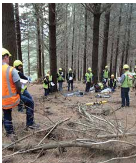
Sampling soils for chemistry and bulk density at the South Island workshop.

Two soil sampling workshops have been held, in Christchurch in May and Rotorua in September. These practical workshops provided a hands-on approach to introduce the tools and fundamentals of consistent soil sampling in a planted forest. These were held in response to forest managers' requests to better understand the soil and the link with stand productivity. Both workshops were well attended with a lot positive feedback received. Practical soil sampling information sheets can be found at http://gcff.nz/publications/ .