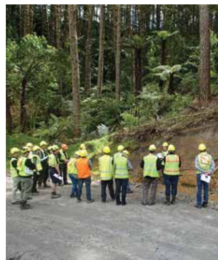
Describing the soil profile at the North Island workshop.