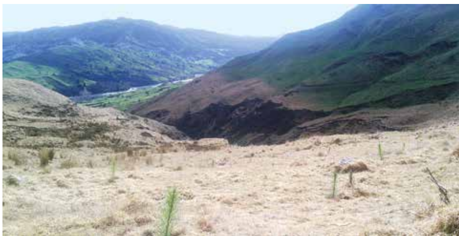
Newly planted radiata seedlings at the trial site in Waikura Valley.

To enable the continuity of harvesting on steep slopes in New Zealand, sustainable methods for preserving soil quality and preventing debris flows post-harvest must be explored. Post-harvest sites in steep country are vulnerable to intense weather events where the risk of erosion and debris flows are increased. There is a period of 6-8 years post planting (window of vulnerability) until canopy closure where the land remains more vulnerable. A new trial has just been established to investigate if it is possible to shorten this window of vulnerability while still maintaining an economically viable radiata pine crop. The trial is in the Waikura Valley in the East Coast of New Zealand.