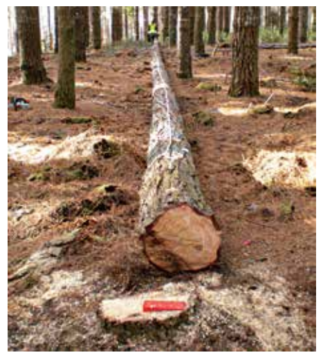
Preparation for biomass measurements.

The research team has been busy in the field sampling the LTSP trials to determine if planted radiata pine forests in New Zealand can be sustainably managed into the future. They recently completed the end of rotation sampling of the Woodhill long-term trial and have now started sampling the Tarawera long-term trial. These trials are part of a larger trial series specifically installed about 30 years ago to test the impacts of harvest removals and fertilisation on site productivity. Rotation-age data from the LTSP trials coming up for harvest (Woodhill, Tarawera and Berwick) will allow the programme to build on earlier trial findings, advancing global knowledge on the sustainability of growing successive rotations.