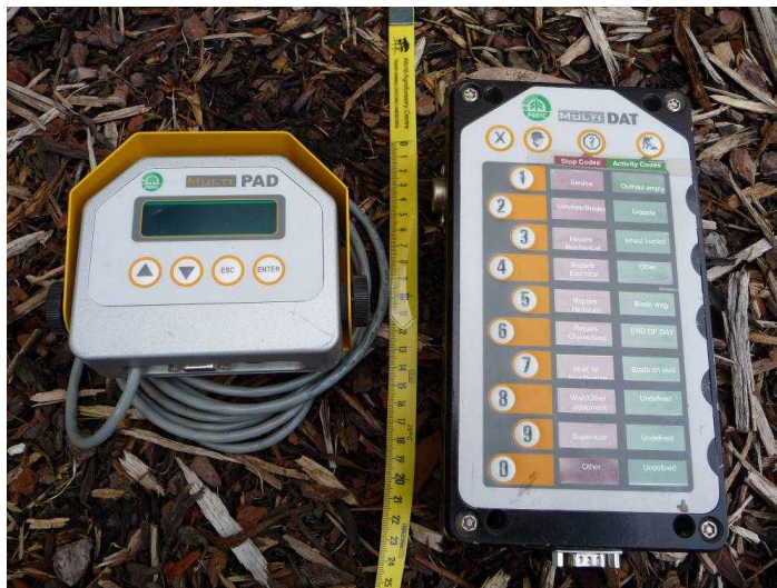
Figure 1: Two components of the MultiDAT system: MultiPAD (left), and MultiDAT Senior datalogger (right).

A MultiDAT Senior unit (Fig.1) with Garmin 15 GPS and MultiPAD, was leased from the southern hemisphere agents, Forme Consulting Group Ltd in Wellington. Details of system set up, configuration, uploading and downloading, viewing, editing, and reporting of data can be obtained from these agents.