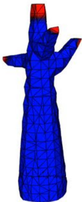
Figure 1: Evaporative fluxes corresponding to test case 3

Figure 1 shows the evaporative fluxes of test case 3.