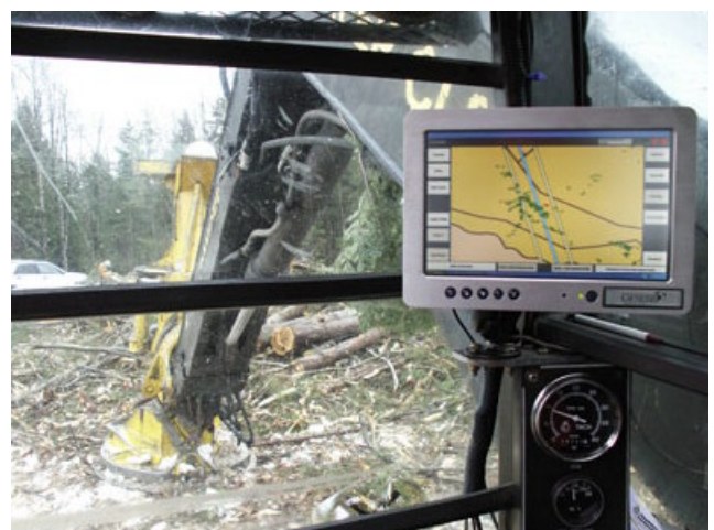
Figure 1. Timber Guide™ unit in harvester cab

Harvesting operations spend considerable machine and operator time navigating harvest blocks, determining location of wood, and estimating optimum yarding distance and location. Genesis Industries' Timber Guide™ Harvest Management System is a GPS navigation / GIS data management system that provides real-time harvest data which can be used to improve operational efficiency, manage costs, and improve the overall quality of harvesting operations. Guess-work is removed by accurately identifying machine location relative to natural or man-made land features, boundaries, and obstacles, allowing operators to focus on harvesting and yarding, with resulting improvements in operational efficiency. In the U.S., independent logging contractors working on purchased stumpage, and contractors working with Plum Creek Timber Co. in multiple southern U.S. states and American Forest Management Inc. in Maine are using this system to improve efficiency and productivity.