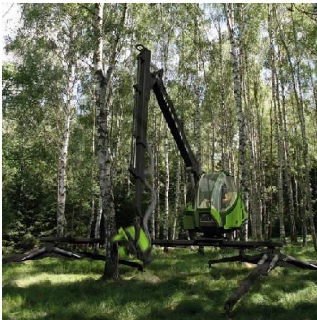
Figure 3. The Striding Harvester

methods" to come up with the large stepping movement motion of the harvester. He argued that his harvester could reach trees up to 10 metres away and create a working area of 480 square metres. Even though the machine is relatively light, the large base created by the widely spread cantilevered feet enables the boom and arm to lift weights far heavier than itself.