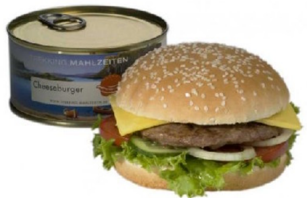
Figure 4. Trekking-Mahlzeiten's canned Cheeseburger

Given that its products will be found in the kit of any international relief organisation, military Special Ops unit or extreme adventure athlete, it is somewhat of an irony that this company should produce the world's first cheeseburger in a can (Fig. 4).