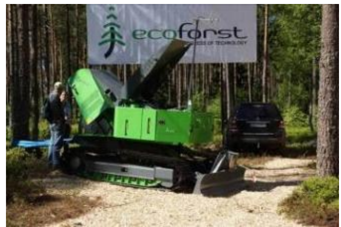
Figure 4: Eco-Forst T-Winch Mobile Traction Winch

is dropped and the winch rope, which runs from the winch at the rear between the tracks and out the integral fairlead on the blade at the front, is connected to the forestry machine as required. Lengths of up to 500 m of 18-mm diameter cable are possible. The cost of the unit is approximately EUR 100,000 ($160,000NZ).