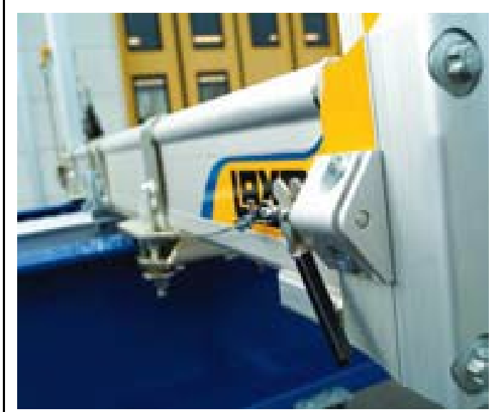
Figure 15: Quick-release mechanism on the bolster of the Laxo LA timber bunk

The Laxo LA is the lightest timber bunk on the market, comprising lightweight aluminium bolsters (9.0 tonne capacity) fitted with a built-in auto-tensioner and a quick-release mechanism on the bunk which enables quick, safe and efficient loading and unloading of both pulpwood and large logs.