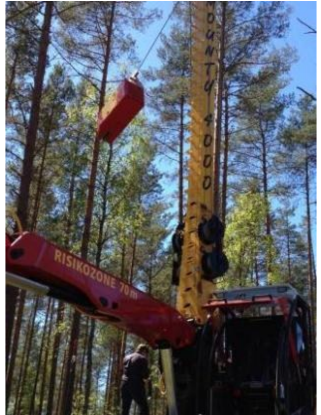
Figure 2: Konrad Mounty 4000 yarder with Woodliner self-propelled carriage

It has the processor crane integrated with the yarder tower to provide a 240-degree working circle. The innovative operator cabin has a quick opening door at the front for quick exit to release the chokers of the inhauled drag. In automatic mode the cab door closes when the operator sits down on the seat. A larger Mounty 5000 is also available from Konrad.