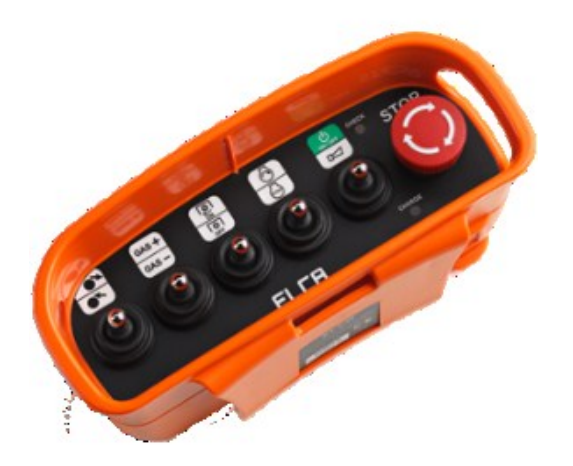
Figure 14: Control panel for the Mito Vetta radio remote control system

Elca Radio Controls of Italy have developed the Mito range of professional radio remote control systems. The innovative transmitting panel drives all the functions separately for single and double drum forestry winches. The Mito range comprises the Mini (small handheld set) and the Alpi and Vetta (waist-attached portable transmitters). It includes Listen Before Talk (LBT) technology designed to automatically scan, find and lock onto a clear and available frequency on pressing the start button (enabling continuous operation without any radio disturbances). It has an operating range of 150 m.