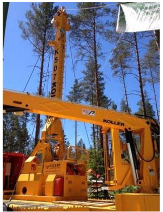
Figure 1: Koller K507 Cable Yarder

transmission to provide 12 tonnes-force of skyline line pull and 8 tonnes-force of line pull for the main and tail rope winches. The drums carry 600 m of 25-mm (1") swaged skyline and 900 m of 14-mm (9/16") swaged main and tail rope. Line speeds for main and tail drums are quoted at 11 m/sec.