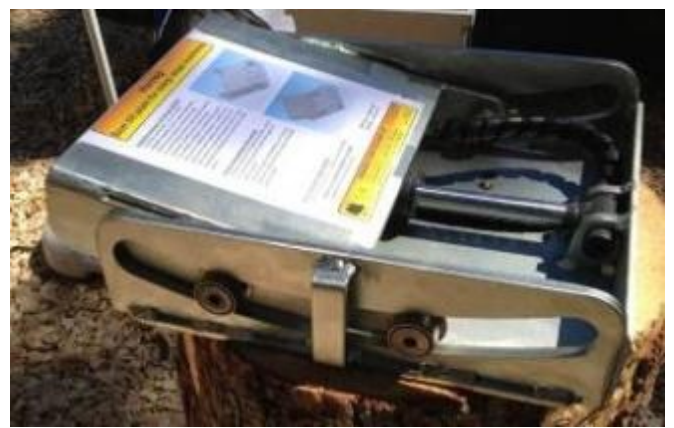
Figure 8: Herzog seat tilt plate

Using an automatic seat leveler such as the Herzog seat tilt plate creates an ergonomically less tiring seat position for the operator, and allows more concentrated and effective work even on steep slopes. The Hydraulic seat tilt plate is installed between the operator's seat and the cab floor. It is tiltable up to 20 degrees and is operated with electrical controls on the driver's seat.