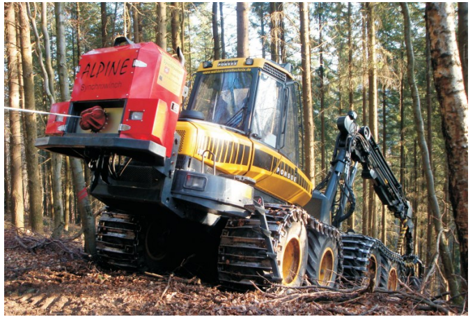
Figure 5: Alpine Synchrowinch mounted on a harvester

The system features synchronised electronic regulation of both winch-drive and wheel drive. This provides automatic gear shift and regulation of the steering mechanism of the winch while driving. The winch drive is hydrostatic, with additional embedded planetary gear unit with integrated spring loaded fail-safe brake.