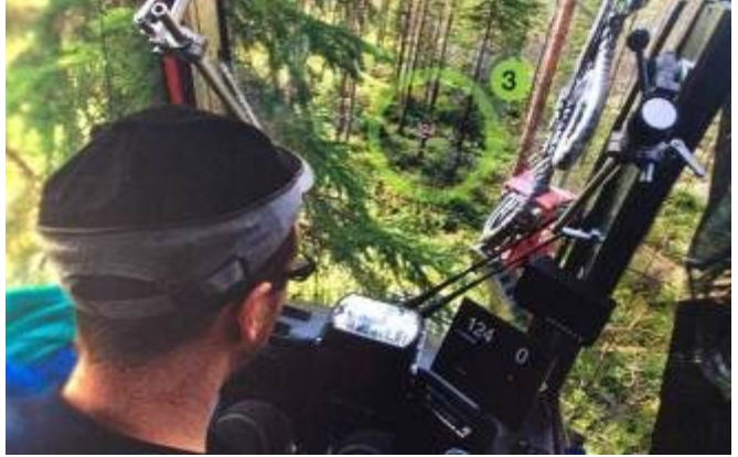
Figure 7: Optea Forest Falcon head up display

(transparent film mounted at eye level). It is based on the Digital Light Processing (DLP) technology developed by Texas Instruments and used in many front projectors today. It gives a clear sharp image of whatever Graphical User Interface is required to be displayed. The system connects straight to the control system of the harvester and is interfaced either with a keypad or an intuitive PC application (on a PC tablet). It receives VGA or HDMI inputs and is controlled through Bluetooth, RS232 or Canbus.