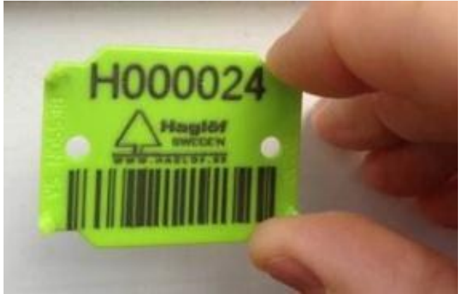
Figure 9: Log tag to link data from Haglöf Digitech Professional electronic calipers

The barcode tags are attached to each log using a hammer loaded with a tag from the magazine (holding up to 40 tags) and attached to the log with a light swing of the hammer against the log end. The cost of tags was reported to be $0.17-0.20 NZD per tag, depending on order size.