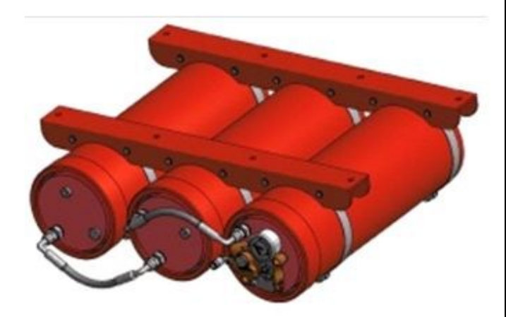
Figure 12: Fogmaker triple extinguisher fire suppression system.

Fogmaker has developed a new triple extinguisher system with a range of 3.3, 4.0, 6.5 or 7.8-litre cylinders. The cost of the system is about NZ $7,000 which compares very well with other fire suppression systems.