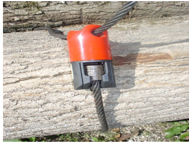
Figure 10: Ludwig Giritzer electronic choker

The weight per choker is 1.6 kg and they can be used on strops of maximum 13 mm rope diameter. They are released at the push of the button and there is no hazard as the system has a mechanical lockout.