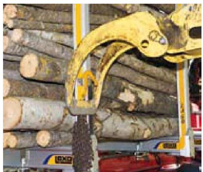
Figure 16: Loader grapple hoisting the chain hook over the load.

Due to the handy chain hook there's no need to throw the chain over the load. Instead, it can be hoisted over using the log grapple. This saves time and reduces the risk of strain injury to the driver's back or shoulders.