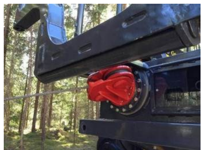
Figure 6: Alpine Synchrowinch mounted on a forwarder

In the forwarder the winch is mounted on the rear frame between the wheels. Dimensions are 1870 mm length, 810 mm wide and 640 mm height. The weight of the winch is about 1700 kg including mounting fabrication materials.