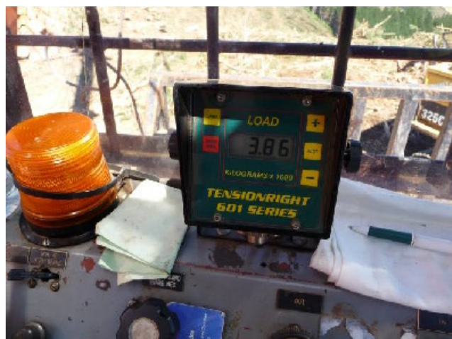
Figure 3. The Tensionright display with overload warning light (on the left).

There are two main types of tension monitor for yarders currently available – those based on deflection of the rope and sheave pin deflection (FITEC, 2000), with the former probably the most common type in use.