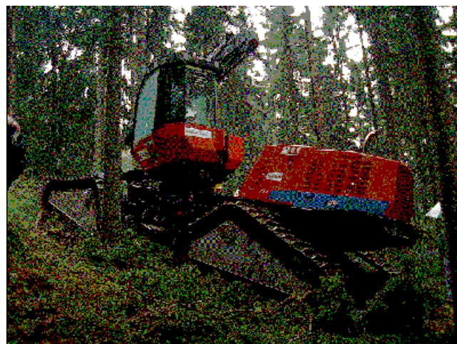
Figure 1: Valmet™ 911 “Snake” steep terrain harvester

European literature shows that bunching for yarder extraction has been concentrated primarily on thinning operations. Heinimann et al. (1998) reported felling and bunching of trees using a Skogsjan 687 harvester in a commercial thinning operation with a Syncrofalke yarder in the eastern Austrian Alps. Bunching with the harvester increased cable yarder productivity by 25%, and using a second choker setter improved yarding productivity by the same order as the bunching effect.