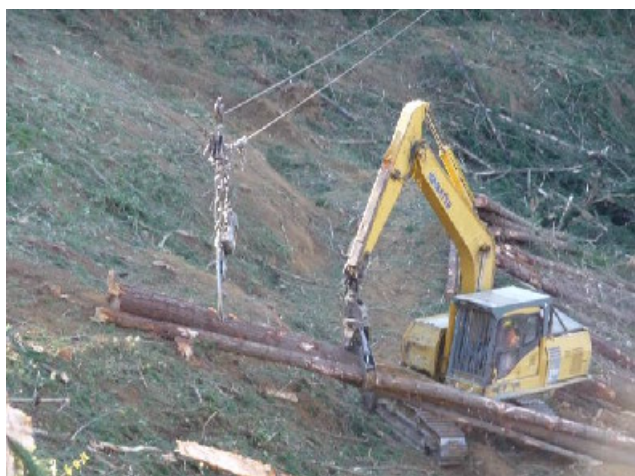
Figure 5: Buncher presenting for grapple extraction.

The main breakout method involved using the bunching excavator to present a bunch of tree butts to the yarder grapple for extraction (Figure 5). The excavator operator called advice over a radio link to the yarder operator for locating the grapple at the right spot for a secure grip. Other breakout methods used a spotter to aid the location of the grapple, or the yarder operator spotted his own haul.