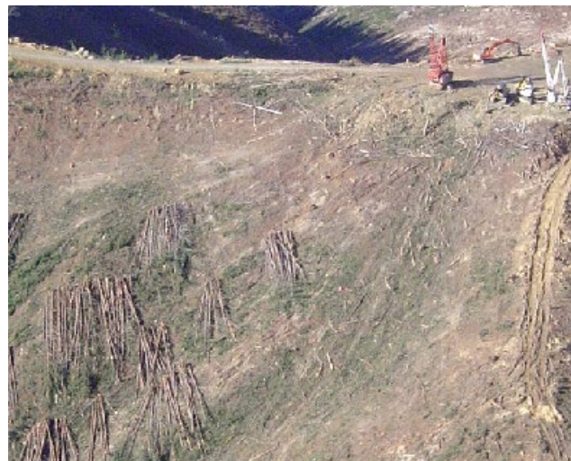
Figure 2: Bunched wood ready for grapple yarder extraction.

for logging small tree sizes on moderate to steep terrain (Figure 2).