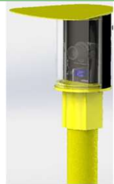
CutoverCam hauler vision