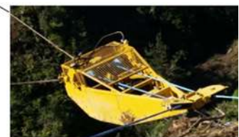
Awdon Skyshifter Tail Hold Carriage