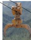
Alpine Grapple extraction