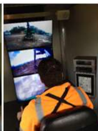
Teleoperated felling with HarvestNav navigation system