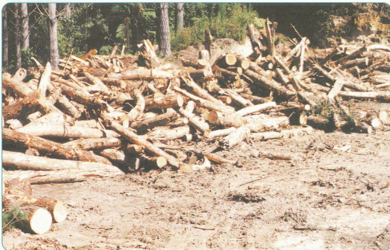
Figure 1 - Stem wood discarded from log making operations