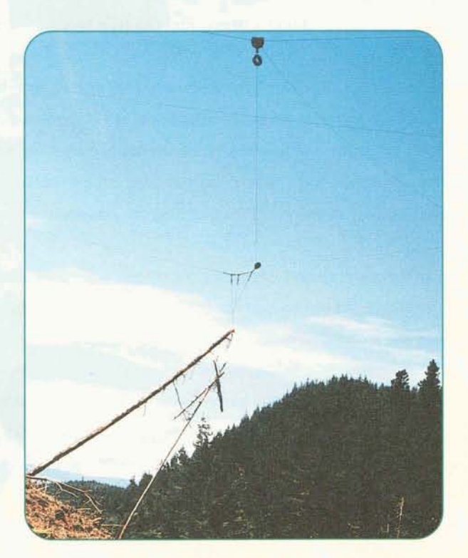
Figure 1 - A drag comprising butt and top pieces