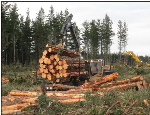
Figure 4. Less bark is lost during felling and extraction with cut-to-length harvester/forwarder systems than with tree length systems.

The greatest portion of bark removal occurs during felling and extraction (58%) with tree-length operations, with a small proportion occurring during delimbing and bucking (22%).