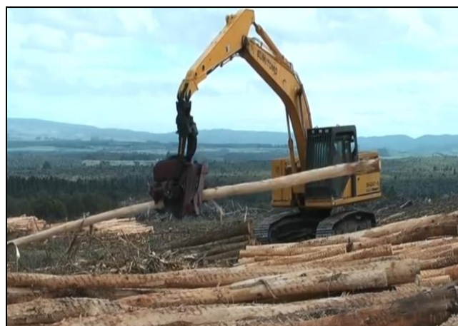
Figure 1. In-forest debarking.