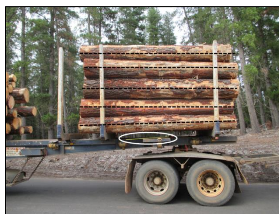
Figure 3. Bunk load of Pinus radiata logs in Western Australia.

Over 4000 stems and logs in eleven studies 2 were measured in Australia and New Zealand using digital photos and a line intercept method to determine the amount of bark removed during normal operations. Figure 3 shows a builder's tape of known length (circled in white on top of the trailer bed) which was used to obtain an approximate length for each log in the image. The black dashed lines on the photograph are examples of transects used to assess the presence or absence of bark using the line intercept method.