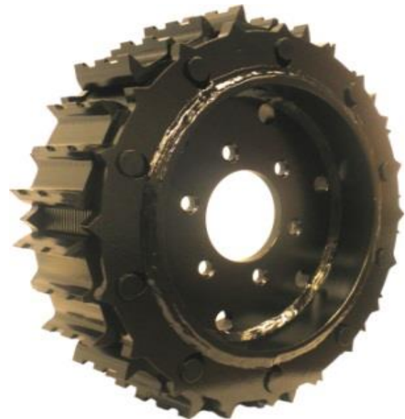
Figure 6: Moipu Feed Rollers

The Australian debarking feasibility trial was carried out in spring in Western Australia. The sponsor for the trial was interested in retaining, rather than removing, as much bark as possible. Eight treatments were carried out; four with a standard Waratah processor head along with various combinations of roller and knife pressures, and four with modified rollers (Moipu feed rollers, Figure 6) along with various combinations of roller and knife pressures. The greatest bark retention was obtained with the standard Waratah rollers and pressures. Reducing the roller and knife pressures for both the standard rollers and the adapted rollers resulted in lower bark retention.