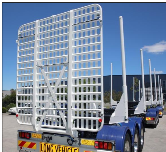
Figure 7. Rear guards of log trailers may be required to prevent loss of debarked logs.

very minor reductions in stack height. Peak storage capacity could perhaps be reduced by a few percent in some cases.