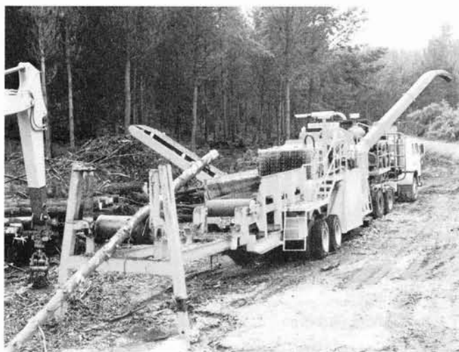
Figure 2 - Infeed end of the Forest King

A 448 kW (600 hp) Cummins model KTA diesel engine powers the 1.47m (58") diameter Morbark chipper by mechanical means, through a twin disk clutch and a set of vee-belts. A separate 6 cylinder Cummins model CTA 179 kW (240 hp) diesel drives the various hydraulic motors for the flail drums, the conveyors and the circuits to the stabilizer jacks. Both of these engines are located at the front end of the trailer frame above the king pin.