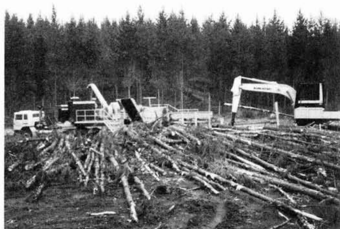
Figure 4 - Thinnings ground skidded to landings were fed directly to the Forest King by a knuckleboom loader.

Productivity was expressed in green metric tonnes (GMT) (Table 1).