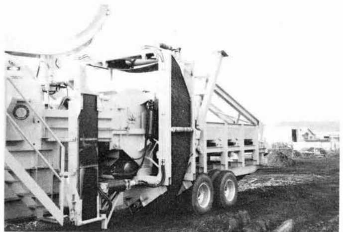
Figure 3 - The infeed conveyor extension, chipper spout and debris elevator folded up for transport

The belt debris elevator frame is hinged to fold on to the top of the machine for transport. The infeed conveyor extension folds in a similar manner for highway travel, as does the chipper spout.