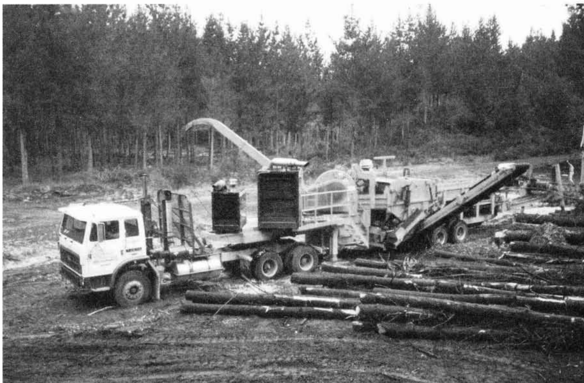
The Forest King 2318 working at Matahina F Forest Block