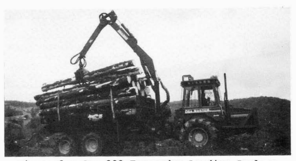
Figure 3 : Osa 280 Forwarder Loading Sawlogs

The Osa 280 is in the large forwarder class, rated at 18 tonne capacity (Figure 3). It is powered by a 155 kW Volvo turbo diesel with hydrostatic transmission and computer controlled three-speed power-Fuel shift and power control. consumption averaged 12.0 litres per hour (120 litres per day).