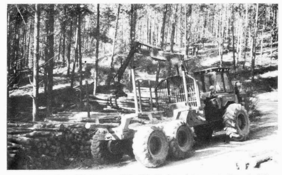
Figure 2 : Kockums 85-35 Unloading at Roadside

(0.6 tonne). Wood presentation was such that each stack required approximately 2 grapple swings to load on the forwarder.