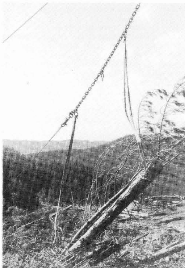
Figure 1 - Polyester roundslings with logs attached

Over the last six years, LIRA has investigated alternatives to wire rope as strops. In 1980, the results of trials with polypropylene strops were reported on (Ref. 1). That Report concluded that polypropylene strops were only suited to logging systems where there was minimal shock loading and abrasion. Later, in 1982, chain strops were evaluated and found to be a viable alternative to wire rope (Ref. 2).