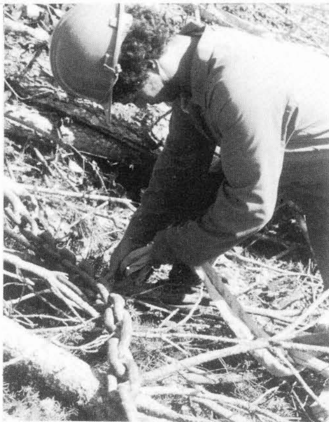
Figure 3 - Attaching roundslings to the rings on the butt rigging

the breakerout would be attaching the empty slings to the logs in the bush. The method of attachment was to feed the slings around the logs and through themselves in a noose configuration. When the rigging was returned to the bush, the whole sequence was repeated.