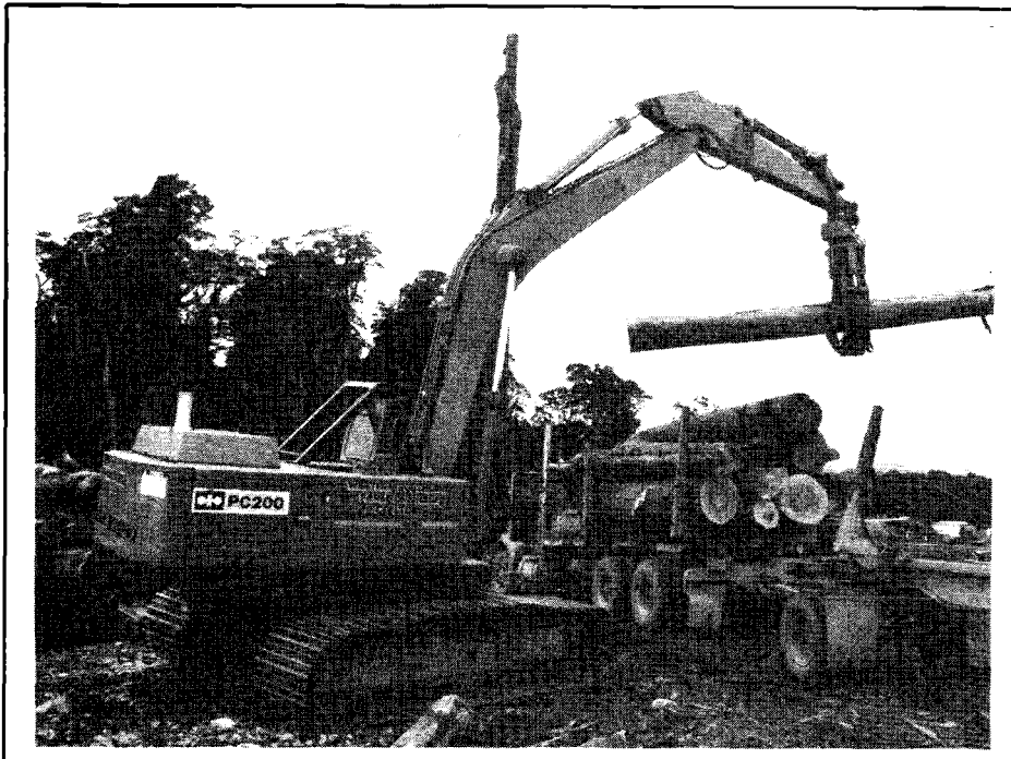
Figure 1 - Loading trailer with excavator-loader