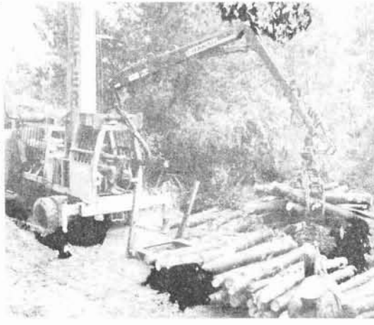
FIG.3 Cranab stacking short-pulp into multi-lift cradles.

The removal of full multi-lift cradles and the replacement with empty cradles proved critical to the smooth flow of wood at the hauler. An alternative method of stockpiling all produce on roadside for uplift with a self-loading truck would be limited by the Cranab being unable to stack the volume of wood from