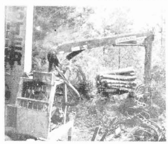
FIG.1 Timbermaster Skyline with shortpulp bundle approaching roadside.

LIRA thanks N.Z.F.P. for making these Reports available for publication.