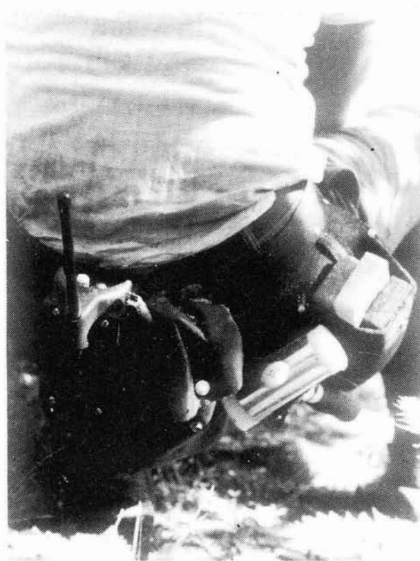
Figure 1 - The Safety Link Alarm attached to the faller's belt

Similar problems with faller isolation exist in other countries where clearfelling of large trees takes place, e.g. Australia, United States and Canada. At the request of member companies and with the assistance of Talkie Tooter (Canada) Limited, MacMillan Bloedel Limited, Fletcher Challenge Canada Limited and the Science