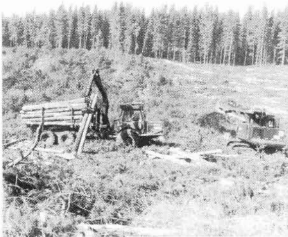
Figure 9 - The different production levels of harvesting machines need to be matched within a system. (Kockums forwarder extracting wood processed by Koehring - APM Forests)

productivity. Tree size is the main factor affecting productivity of mechanical harvesting systems once a threshold of about 80 m 3 /ha yield has been reached.