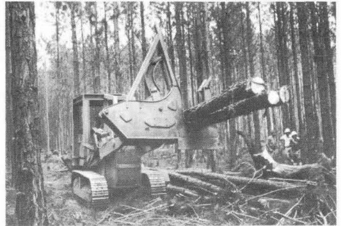
Figure 3 - Clever Hole delimber - Logs are held in front jaws during delimbing and transport