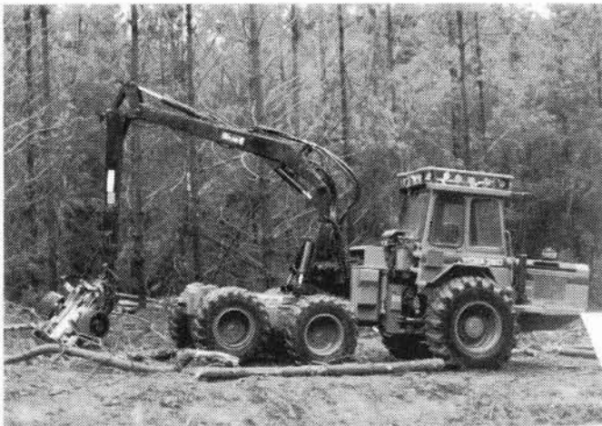
Figure 8 - Osa boom mounted processing head

There are quite a few secondhand John Deere's available in Australia. The Osa is a well engineered, highly productive machine but is complex and very expensive. The Lako and Kockums GSA both have a large number of vulnerable hydraulic hoses around their head. The Osa, Lako and Kockums GSA all use chainsaw felling systems which are very vulnerable to operator abuse, particularly during the learning phase.