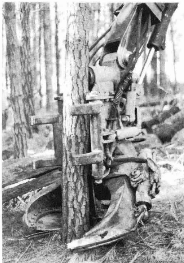
Figure 4 - Mechanical tree shears

The simplest way to fall a tree mechanically is with shears. This method is not widely used overseas because of the end checking which occurs in the butts of trees, particularly when they are frozen. However, APM Forests' experience is that, provided the shears are properly aligned and they are kept sharp, the maximum checking in radiata pine seems to be about 5 cm long, which leads to less wood loss than occurs when a proper scarf is used in falling the tree by hand.