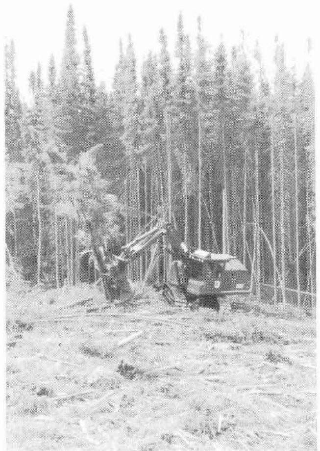
Figure 5 - Koehring circular saw felling head

The only high speed circular saw felling head in use in Australia is the Koehring. This is a remarkable unit in terms of felling speed in a clear falling operation, but its cutting speed is of no real advantage in thinnings. My experience of this machine is not good enough to comment on its mechanical reliability, but it does make a woolly mess of the butt end of the tree. I am assured that this has no affect on the quality of the sawn product from the butt log, but I cannot verify this comment from my experience.