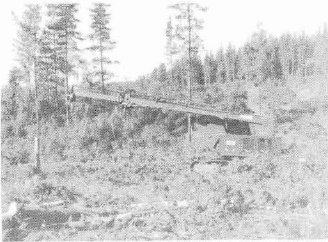
Figure 6 - Koehring slide boom delimber

The slide boom type has the following advantages :