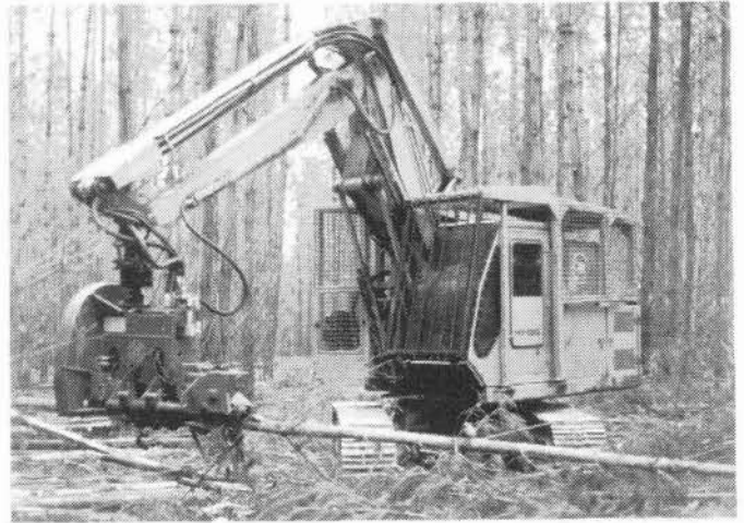
Figure 7 - Steyr KP40 delimbing head

carrier with low operating costs, apart from maintenance of the head.