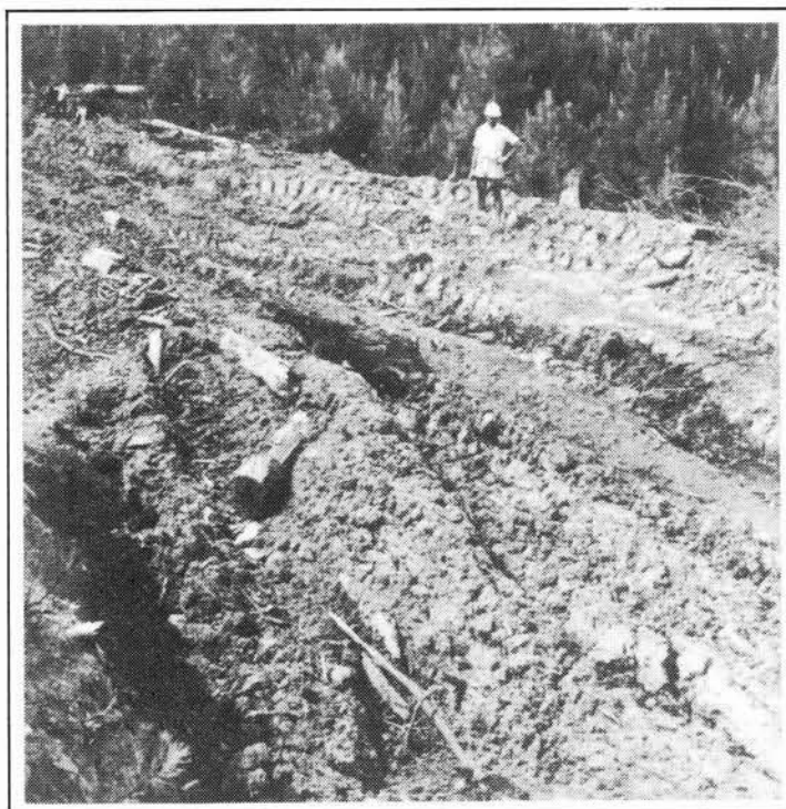
Fig. 1 - Extreme example of soil disturbance on a skidtrail crossing a clay soil. Note the great width of this skidtrail

A Report by G. Murphy and E. Robertson, Forest Research Institute, Rotorua