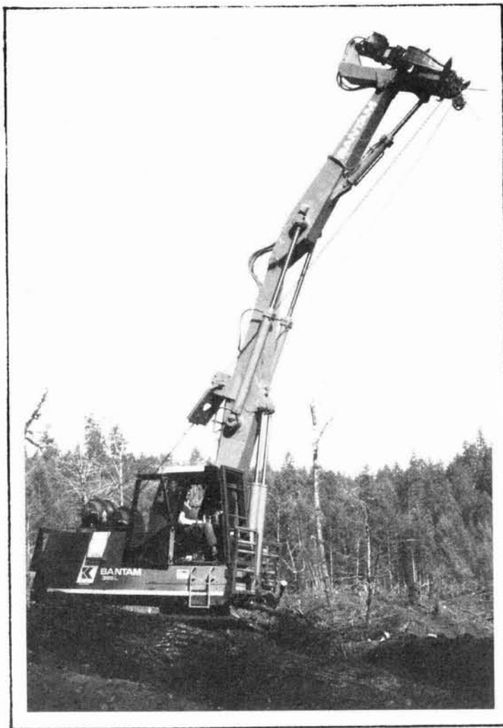
Loader conversion using hydraulic winches

Hydraulically-driven auxiliary winches are increasingly used by American loggers and have been mounted on a wide variety of logging machines. Some applications are :-