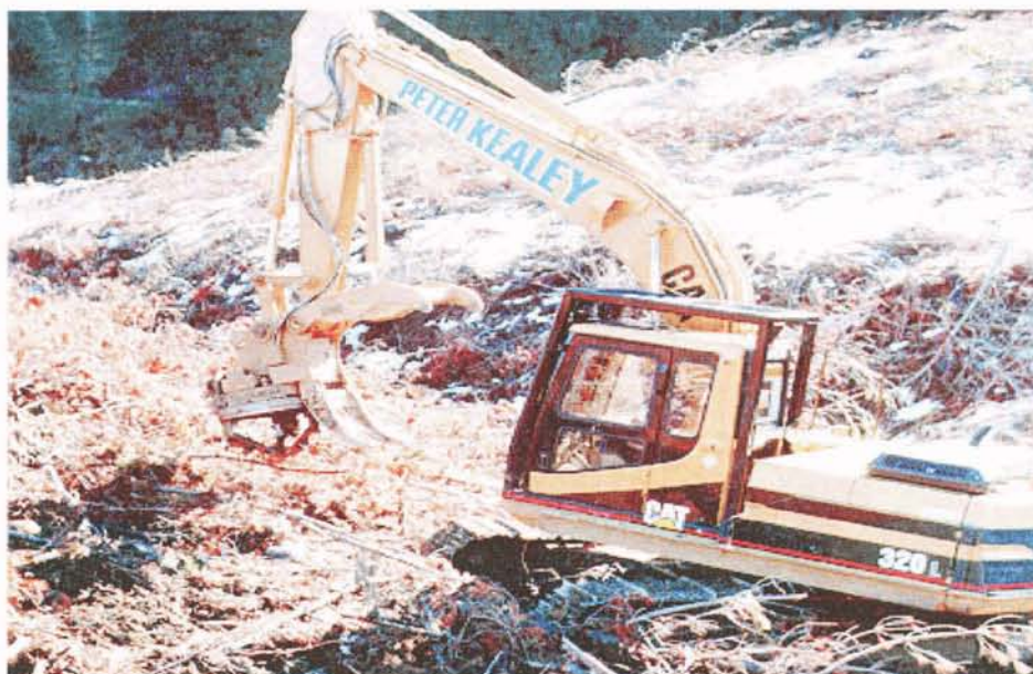
Figure 1 – VH Mulcher spot cultivator operating in cutover