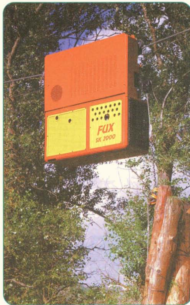
Figure 3 - "Fux" SP carriage.

Two types of Fux carriage are available: the SK 2000 capable of 2 tonne payload and a speed of 4.8 m/sec. The 4 tonne carriage (SK 4000) has two drive systems and is limited to a maximum