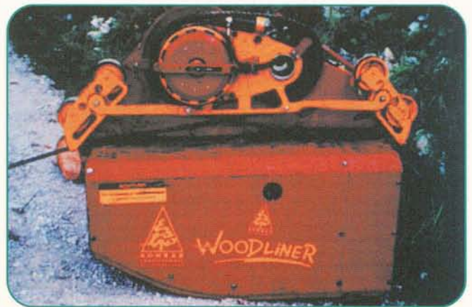
Figure 2 - "Woodliner" SP carriage.

The Austrian "Woodliner" was the first single cable self-propelled carriage capable of going over intermediate supports. It runs on a 20 mm diameter skyline and the carriage has an internal cable drum that is capable of holding 60 metres of 10mm dropline (Figure 2).