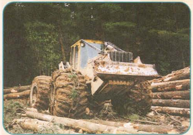
Figure 1 - Diack Logging's JD640E skidder