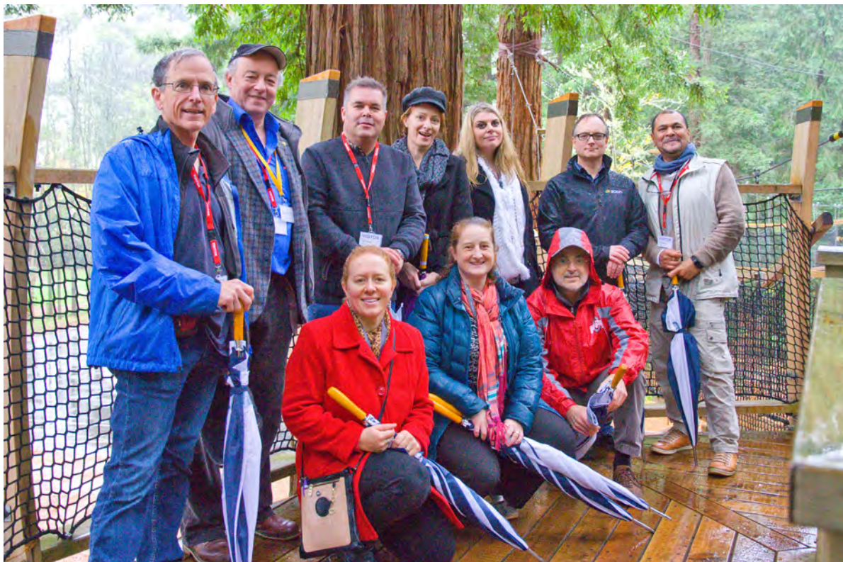
The HTHF review panel and team members on the Rotorua Redwoods Treewalk