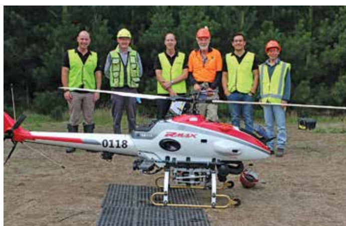
Staff from Yamaha and Scion celebrate the successful application of treatments to a trial area near Rolleston, Christchurch (left). A practice application by the UAV (right).