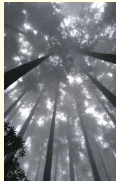
Listening to the dawn chorus in the Douglas-fir stand at Ross Creek Reserve at the start of the GCFF field trip.