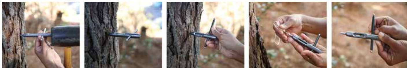
Microcore sampling using a Trephor tool.