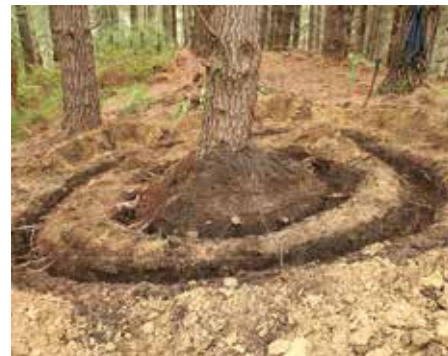
A 23-year old radiata pine tree trenched at 1 and 2m distances from the stem to obtain lateral root distribution data.