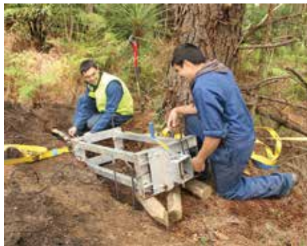
University of Sassari (Italy) researchers conducting root pullout tests on 23-year old radiata pine trees near Gisborne.