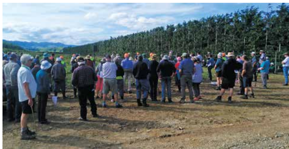
NZFFA conference attendees listening to a presentation describing the potential benefits from reduced chemical applications and the better use of beneficial soil microbes.

This annual event is an important forum for Scion scientists to present and discuss new information with the FFA membership;