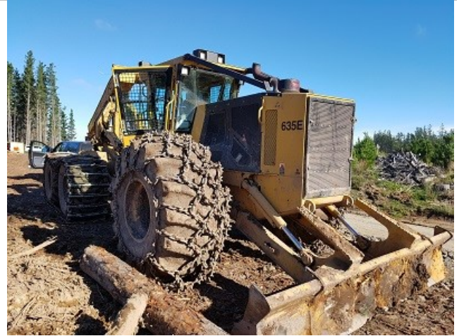
Figure 3. The Tigercat 635G six wheeled skidder

The site was located just north of Dargaville in Northland. Again the site was rolling.