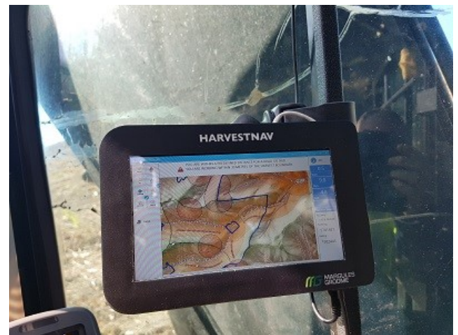
Figure 1. The HarvestNav installed in the cab of a harvester

From the commencement of the FGR Steepland Harvesting Programme in 2010, a project has been active to develop an on-board machine navigation system comprising a computer tablet with internal GPS, and software (Figure 1) for mounting in the machine cab (Marshall, 2012).