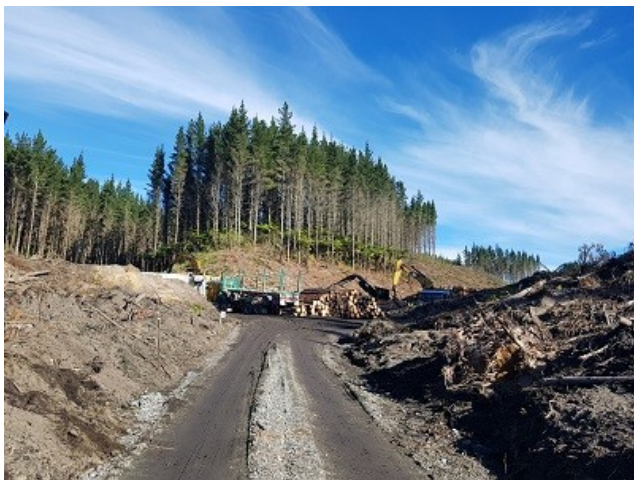
Figure 2. Site 1 in Kawerua Forest

Site 1: The HarvestNav was installed on a Caterpillar 325FM excavator-based harvester at Blue Mountains Logging Ltd. The crew was a ground-based harvesting operation, working in Kawerua Forest in the Western Bay of Plenty. The site was rolling with a large number of archaeological sites. The operator was comfortable with computers and was already using Avenza Maps, a mobile map 'app' for downloading maps for offline use on iOS or Android smartphones or tablets and on Windows 10 devices. The built-in GPS on the smartphone was being used to track his location on the .pdf map on his mobile phone.