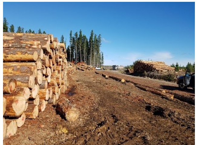
Figure 4. Site 2 located north of Dargaville, Northland