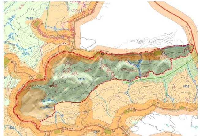
Figure 6. The harvest plan for Site 2 – this is the view the operator saw on HarvestNav.

be noted that on this site HarvestNav was installed in a skidder, and this was only a temporary installation.