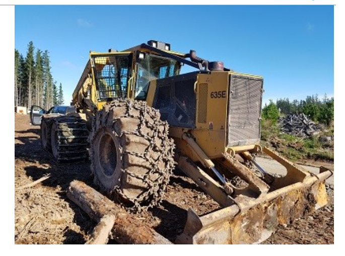
Figure 3. The Tigercat 635G six wheeled skidder

The site was located just north of Dargaville in Northland. Again the site was rolling.