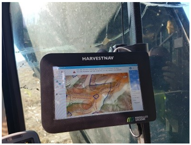
Figure 1. The HarvestNav installed in the cab of a harvester

From the commencement of the FGR Steepland Harvesting Programme in 2010, a project has been active to develop an on-board machine navigation system comprising a computer tablet with internal GPS, and software (Figure 1) for mounting in the machine cab (Marshall, 2012).