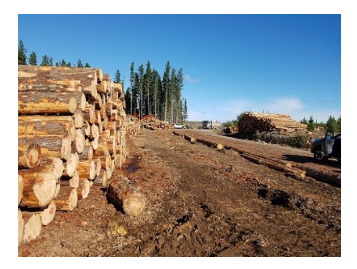
Figure 4. Site 2 located north of Dargaville, Northland