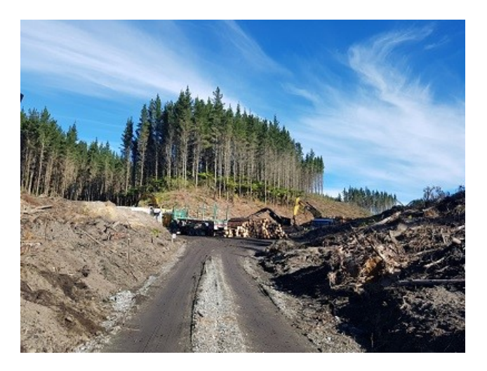
Figure 2. Site 1 in Kawerua Forest

Site 1: The HarvestNav was installed on a Caterpillar 325FM excavator-based harvester at Blue Mountains Logging Ltd. The crew was a ground-based harvesting operation, working in Kawerua Forest in the Western Bay of Plenty. The site was rolling with a large number of archaeological sites. The operator was comfortable with computers and was already using Avenza Maps, a mobile map 'app' for downloading maps for offline use on iOS or Android smartphones or tablets and on Windows 10 devices. The built-in GPS on the smartphone was being used to track his location on the .pdf map on his mobile phone.