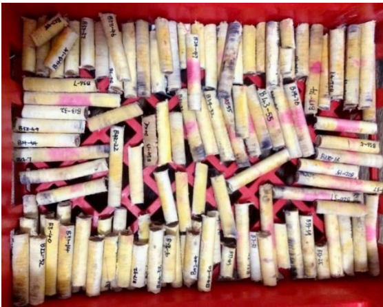
Photo below shows E. bosistoana cores removed for heartwood assessment. It was found that there is a strong genetic component to heartwood quantity with some families having no heartwood and others having over 70mm. These trees were only 6 years old and were developing true heartwood.

When assessing heartwood quality NIR is used to predict extractive content. There is significant variation between families for extractive content with %s ranging from <5% to >10% at the average family level. This demonstrates the potential to improve the natural durability using breeding.