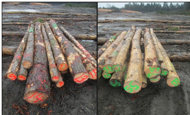
Figure 4. Logs with bark largely intact (left) and with bark largely removed (right) in New Zealand Spring drying rate trial.