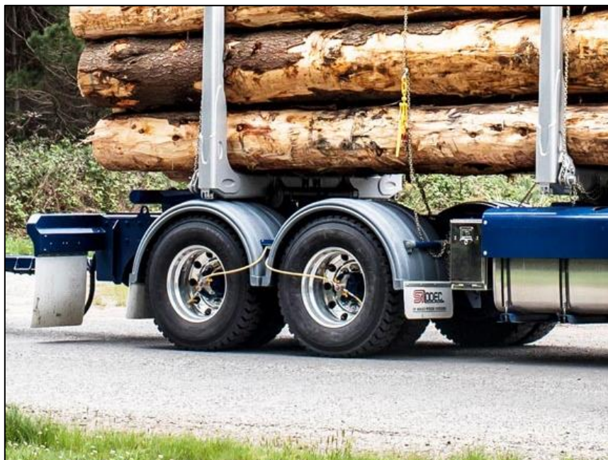
Figure 7. Load securement of debarked logs during transport has been identified as a potential risk in the preliminary review of safety

There have been a number of trials conducted around these coefficients of friction of logs as it relates to load securement in transport and these have become the underpinning knowledge for load securement standards in North America, Australia and New Zealand. Though the trees across these regions are quite different the effective coefficient of friction is similar. For logs with bark on the static coefficient of friction tends to be between 0.8 and 0.7 (i.e. a force equivalent to 70% to 80% of the weight of the log is required to get the log sliding) and the dynamic coefficient of friction drops to about 0.5 (i.e. once the log is sliding it requires a force equivalent to about half the weight of the log applied to keep in moving). For logs with bark removed the static coefficient of friction typically drops to 0.6 to 0.5, with more dense (harder) woods tending to have a lower coefficient when they are dry and as low as 0.3 if they are wet (under rainy conditions). The dynamic coefficient of friction for dry debarked logs is typically between 0.4 and 0.3 and as low as 0.2 for wet logs. This reduction in the coefficient of friction, particularly under wet conditions will have important safety implications for the handling, storage and transport of the logs in the supply chain.