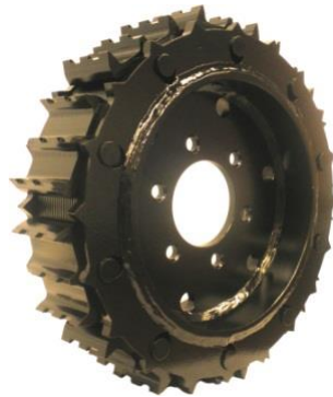
Figure 5. Moipu outer feed rollers similar to the one above and manufactured by Moisio Oy in Central Finland were included in the Australian debarking feasibility trial.