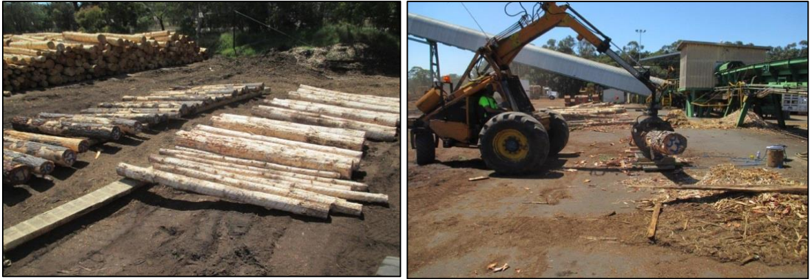
Figure 3. Logs used in Australian Spring drying rate trial (left) and log being placed on weight scales (right).

conditions for the trial period were as follows: mean temperature 11°C, mean wind speed 20km per hour, total rainfall 12 mm.