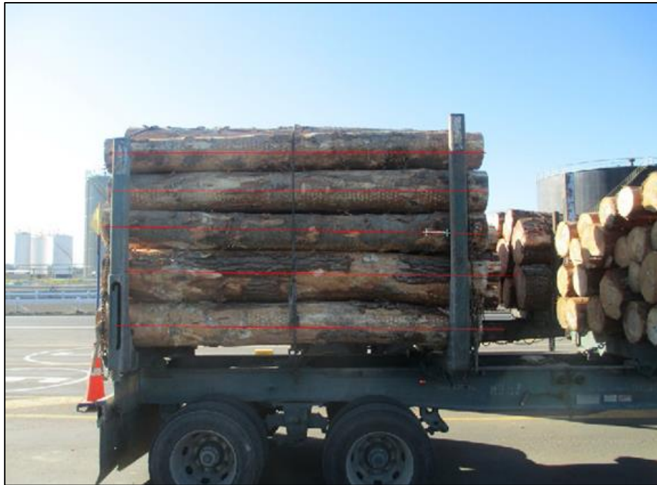
Figure 2. Image of load of logs with lines overlaid in preparation for measurement of bark loss using the line intersect method.