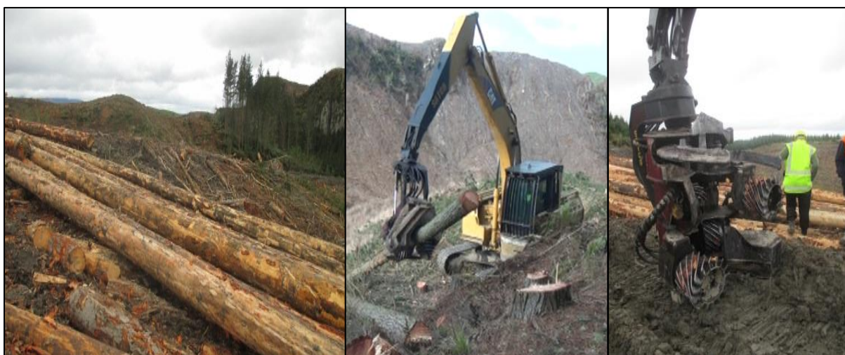
Figure 6. Small almost fully debarked stems (left), Caterpillar excavator with SATCO head (centre), 22 inch SATCO eucalypt debarking head (right)

Twenty three stems were felled near a roadside. The stems had their slovens removed, and then were delimbed and passed to a grapple loader for stock-piling. Some stems were too big for efficient handling by the debarking head. Table 4 presents the results of a short time study of the operation. The average time for handling broken top pieces was 0.07 minutes per stem, “machine suitable” stems was 1.16 minutes per stem, and “too large” stems was 5.25 minutes per stem.