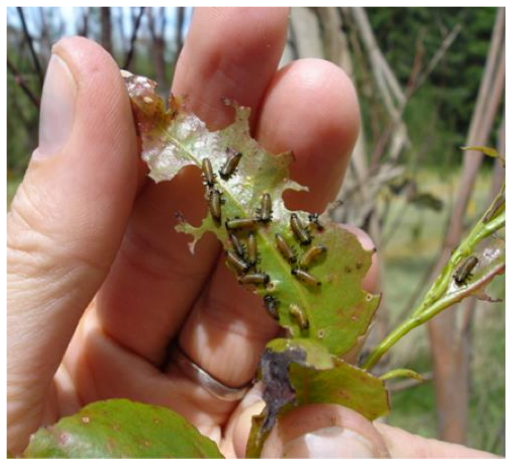
Eucalyptus tortoise beetle larvae, the target pest

To be at risk of exposure to Eadya daenerys , larvae of non-target beetles need to feed externally during the daytime on the leaves of their host plants for at least a portion of their lifecycle. They would also need to do this in springtime (November-December) when Eadya daenerys adults will be active.