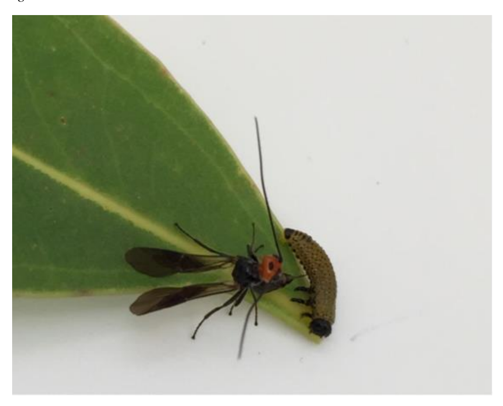
Eadya daenerys, proposed biological control agent