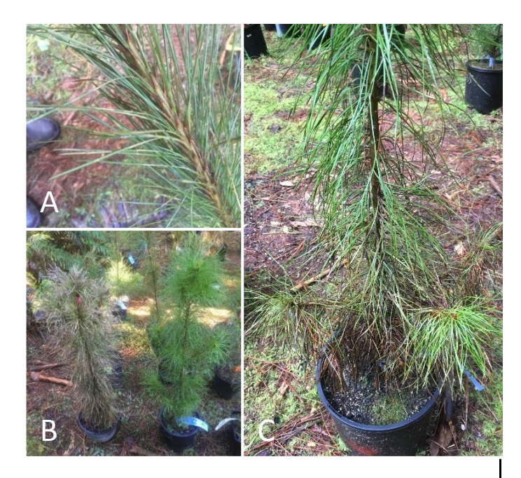
Figure 1 A-B , copper phytotoxicity on potted radiata pine plants at Kaingaroa in June; A , olive lesions on a plant recently sprayed with copper; B , needle death on a sprayed plant (left) compared to a healthy unsprayed plant (right). C , Phytophthora pluvialis infection towards the base of an untreated radiata pine plant at Kaingaroa in August.