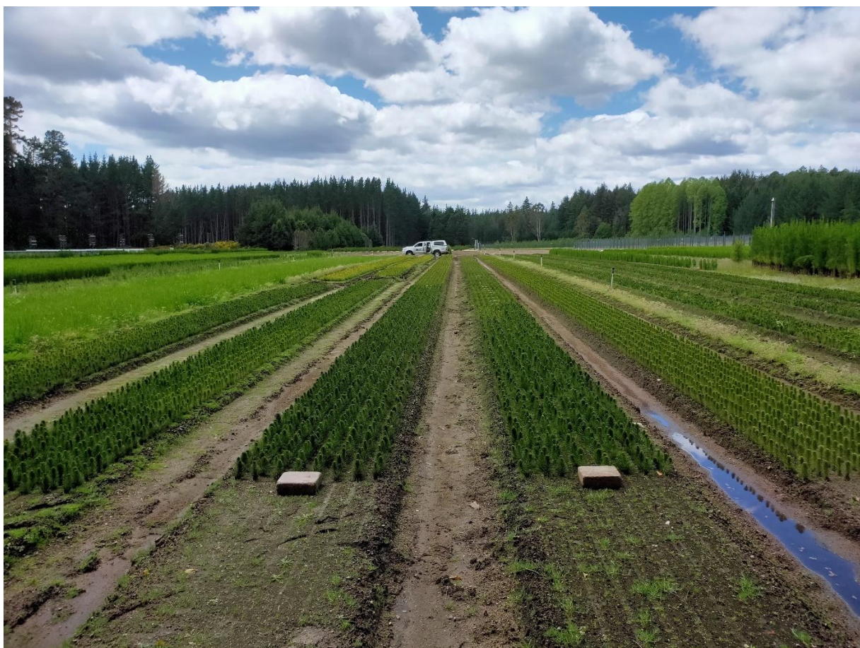
Figure 1: Trial beds containing cuttings for sensor testing at Scion's nursery.