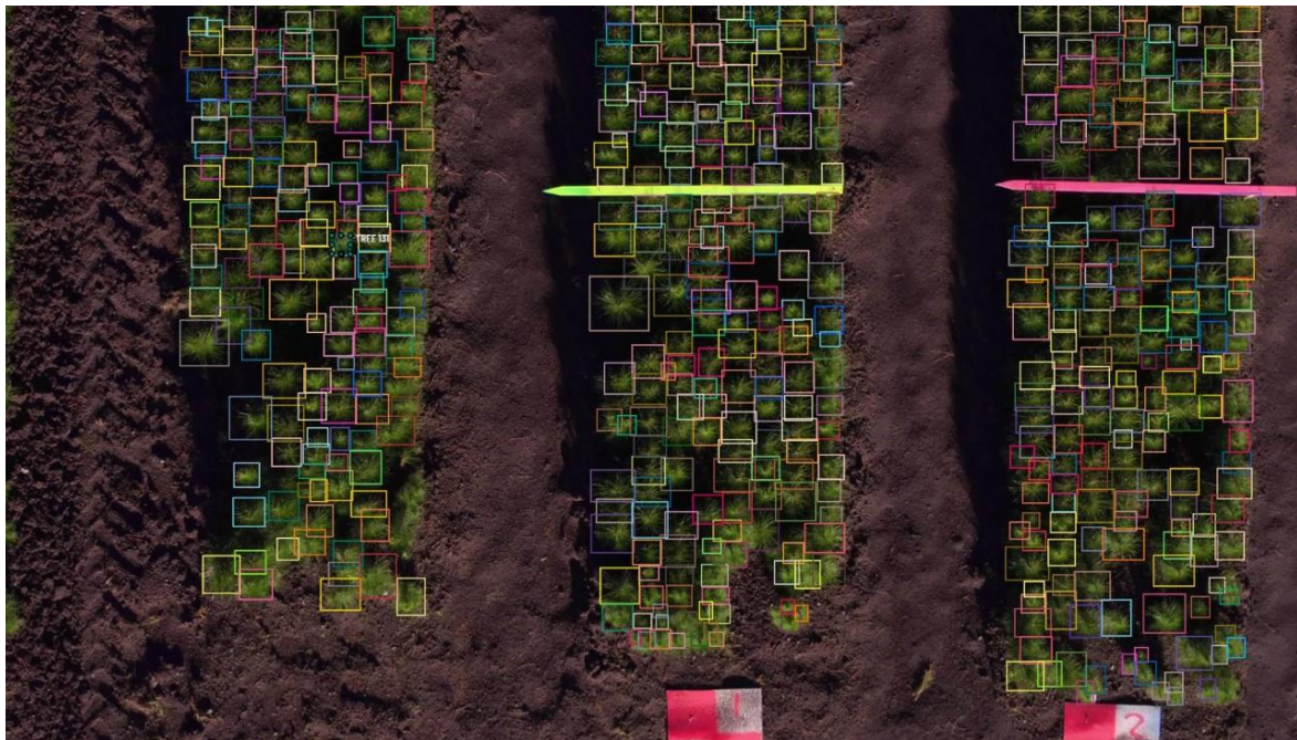
Figure 4: Densely annotated training data from previous data captures used to train seedling detection models.

The proposed approach will use the RCNN-based detection algorithms e.g. Faster / Mask-RCNN. This family of algorithms are based on data-hungry deep learning methods and a major challenge will be to develop a suitable training dataset from such limited data capture. Data annotation consisting of outlining individual seedlings and this task has been carried out on the first batch of test data (Figure 4). This work has generated several hundred training examples, but this is well short of the target of several thousand examples. The next step in the programme will be to explore the use of data augmentation approaches to 'synthesise' additional training data. In addition, we will acquire and annotate new data from the current crop and other beds containing comparable seedlings once the growing season is well underway.