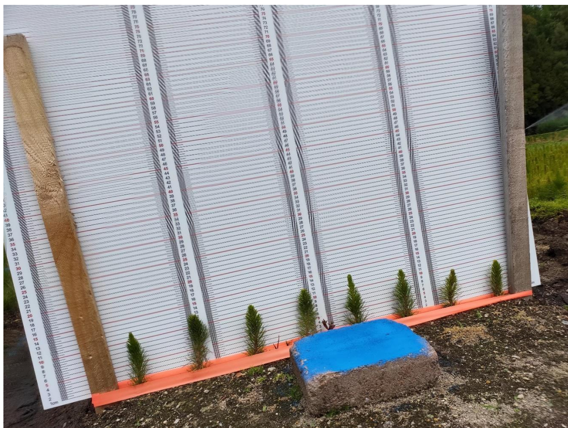
Figure 3: Measurement board for rapid, accurate measurement of seedlings in a row.

In terms of ground-truth data, the first UAV data capture was performed in late November and the ground-truth measurement board has also been fabricated and is being used to capture ground-truth heights. This work will be completed before the end of November / early December. The slow growth of the seedlings permits some time gap between the different measurements planned, but we will move towards a co-ordinated capture of all data within a few days as the growth rate increases.