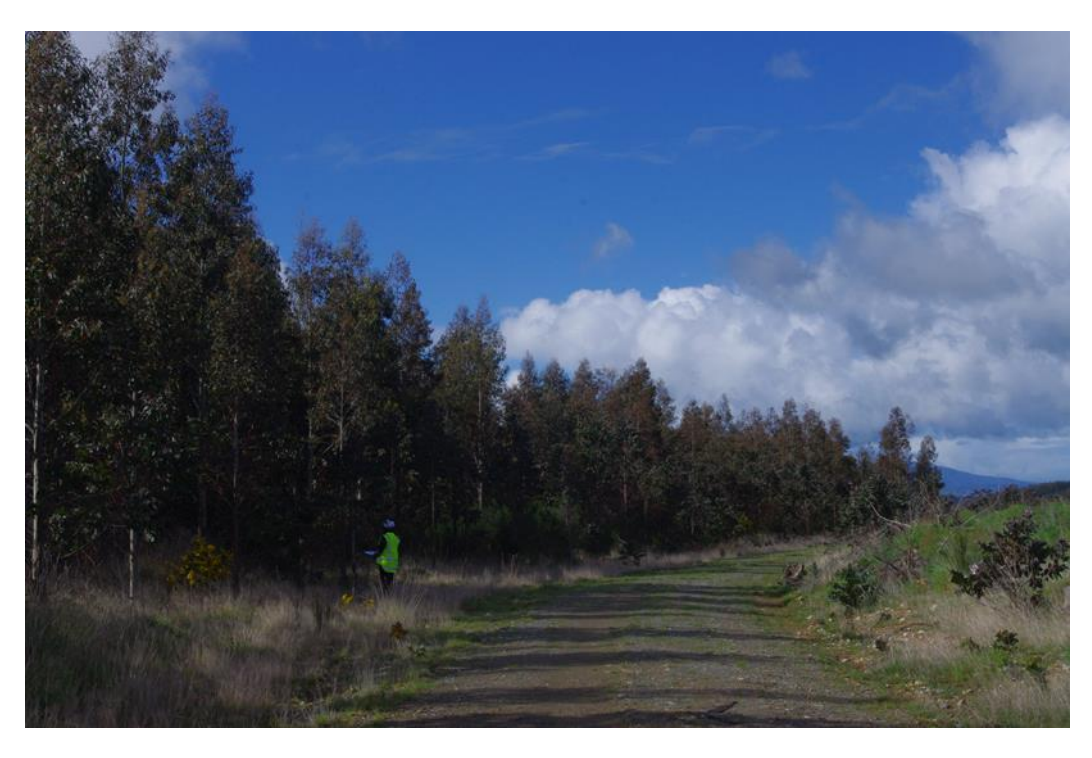
Figure 3. Eucalyptus nitens progeny trial at Howdens Block in Southland was established in 2011. The tree material at this trial originates from Alexandra, Tinkers and Waiouru seed-orchards and was established to test a sub-set of the families in the breeding population for resistance to the leaf-eating beetle Paropsis data is now available from this site to use in selection next generation parents for testing.