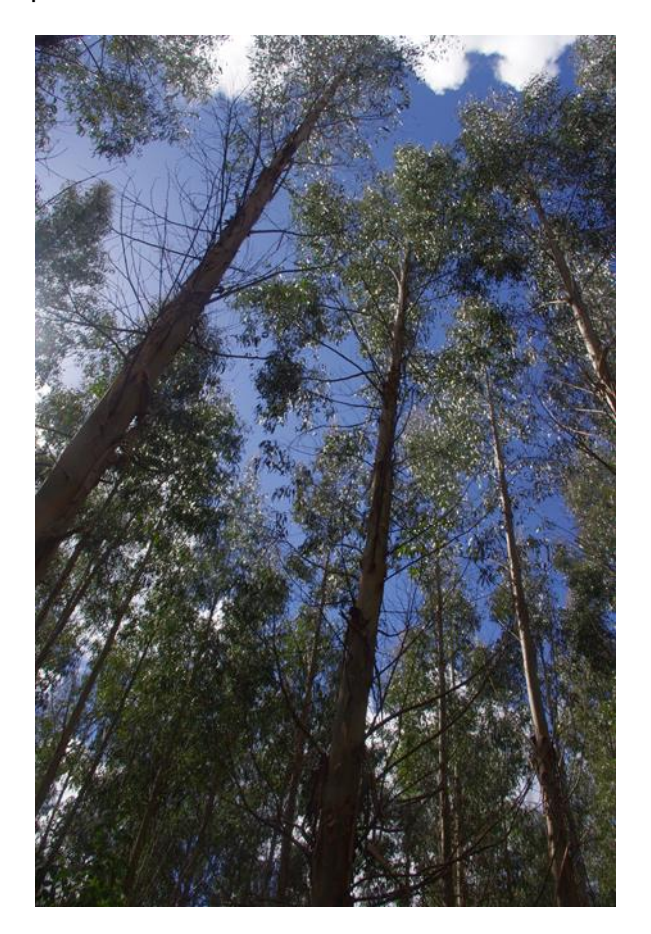
Figure 1. Keens Block progeny trial in Southland where the tree material in the breeding population was evaluated for solid wood properties.

Around 12,000 genomic markers were useful for the prediction of genomic breeding values in the E. nitens population after filtering which, based on statistical significance of a SNP marker in the study by Klapste et al. (2016). The accuracy of genomic predicted breeding values significantly surpassed the accuracies of BLUP breeding values in the proof-of-concept study for most of the traits (Klapste et al. 2016). Resende et al. (2012) reported that proportion of the accuracy of phenotypic BLUP selection recovered by GS in Eucalyptus varied from 0.75 to 1.20 depending on the trait and population in question.