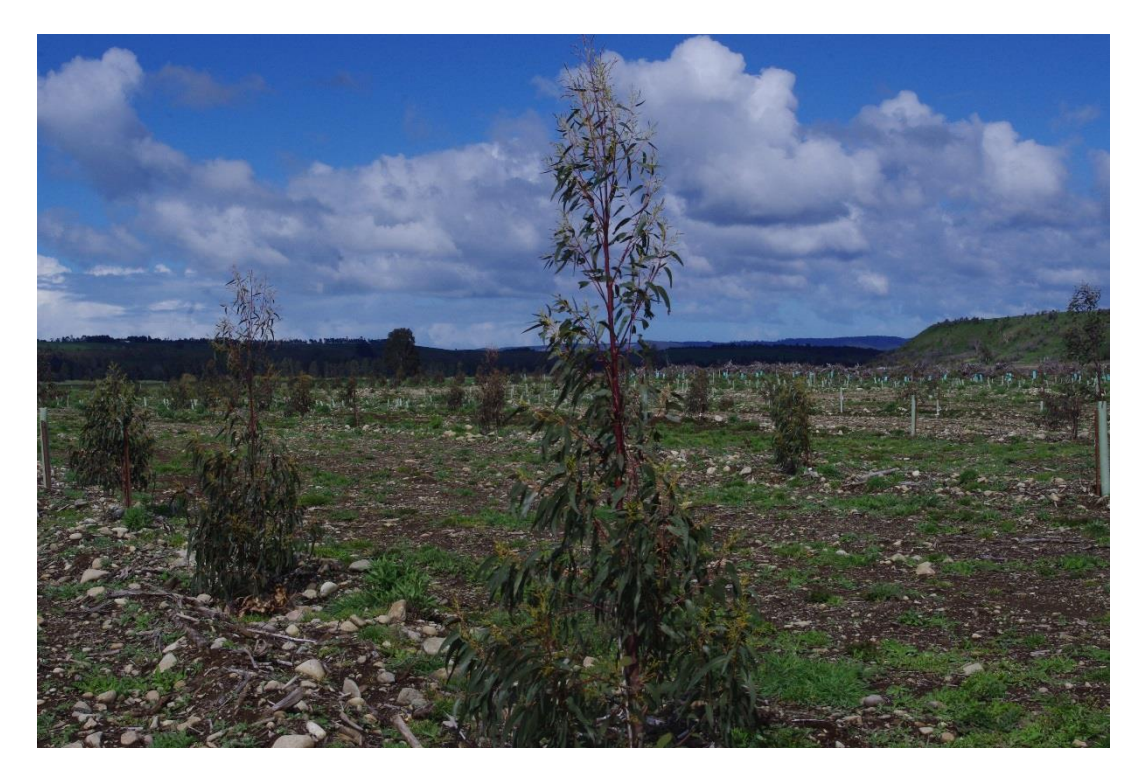
Figure 2. New production seed-orchards established at Clarkes Forest (South Wood Export) in 2015 targeting for improved solid wood properties.