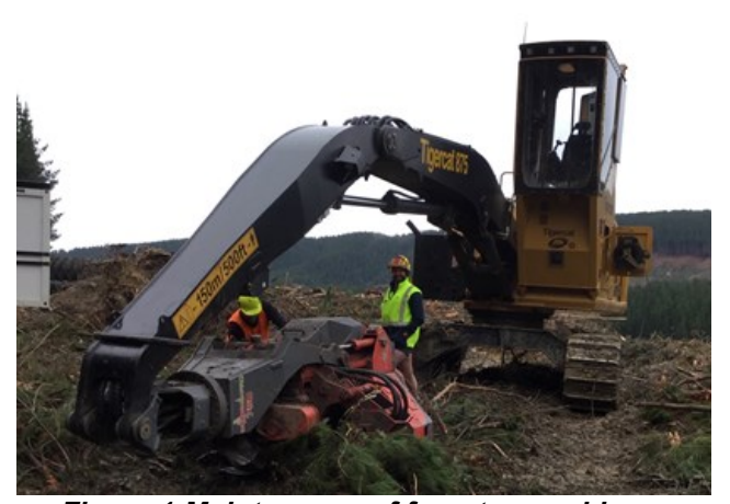
Figure 1:Maintenance of forestry machinery

This study is part of the "Forestry Work in the Modern Age" Primary Growth Partnership (FGR, 2018), one of the drivers of which is to make harvesting and log logistics operations safer. Analyses of incident reports will provide a baseline of event types, situations and causes from which any improvements in safety due to interventions such as new technology (or other innovations) on the log landing developed in the FGR programme can be measured.