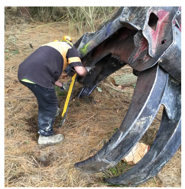
Figure 4: Chain maintenance.

the process of changing the chain on the cutter bar and another two events were during chain sharpening.