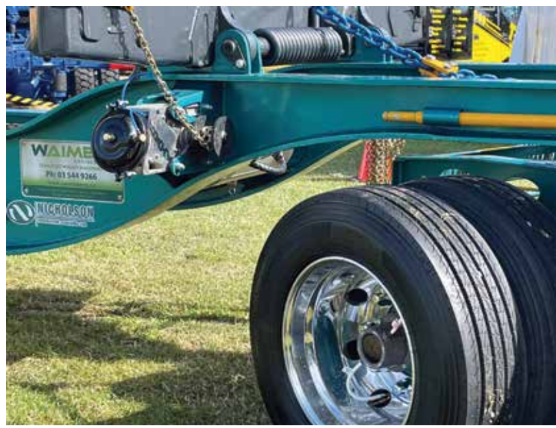
Figure 5: Trinder Engineering auto tensioner mounted on a log trailer