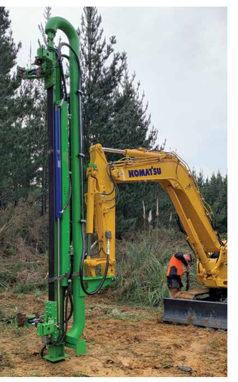
Figure 8: Hudson Clearwood pruning machine undergoing field trials

of research and results that are applicable to small, medium and large forest growers.