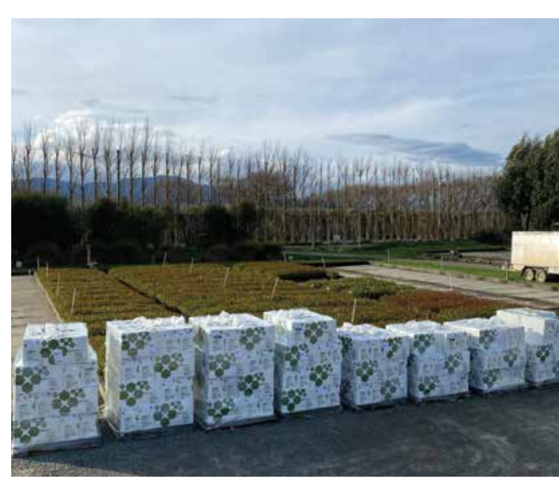
Figure 6: Assessing genetically improved eucalyptus seedlots in the Dryland Forestry Initiative

The SWP has identified and developed market sectors, including naturally durable timbers,