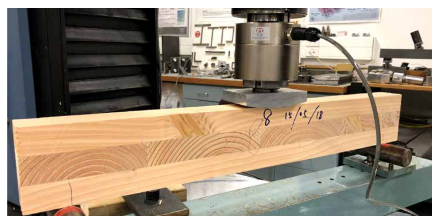
Figure 7: Strength testing of Douglas-fir CLT element

A 20-year Cypress Strategy has been produced to encourage investment in the Cypress industry.