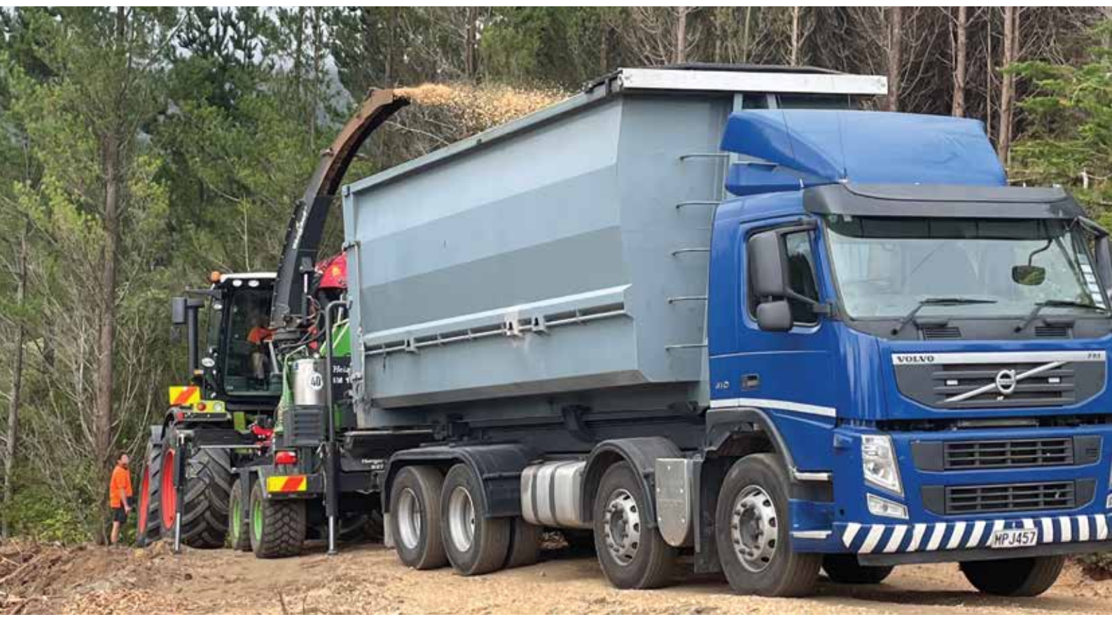
Figure 1: Biomass chipping at G.J. Hunger Contracting Ltd, Taranaki